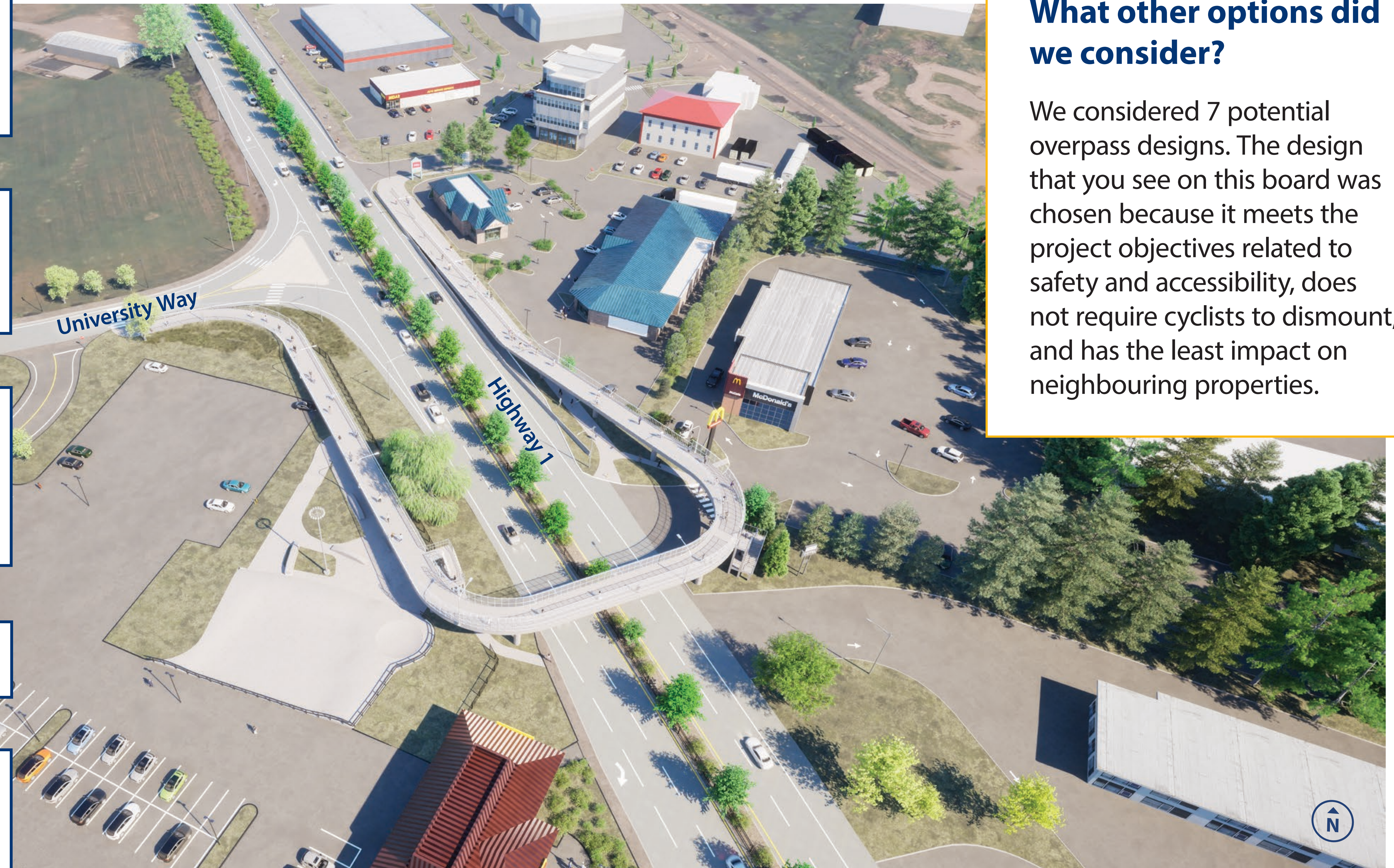
An artist's rendering of the North Cowichan Active Transportation Overpass facing north. Rendering is conceptual and subject to change.

We considered 7 potential overpass designs. The design that you see on this board was chosen because it meets the project objectives related to safety and accessibility, does not require cyclists to dismount, and has the least impact on neighbouring properties.