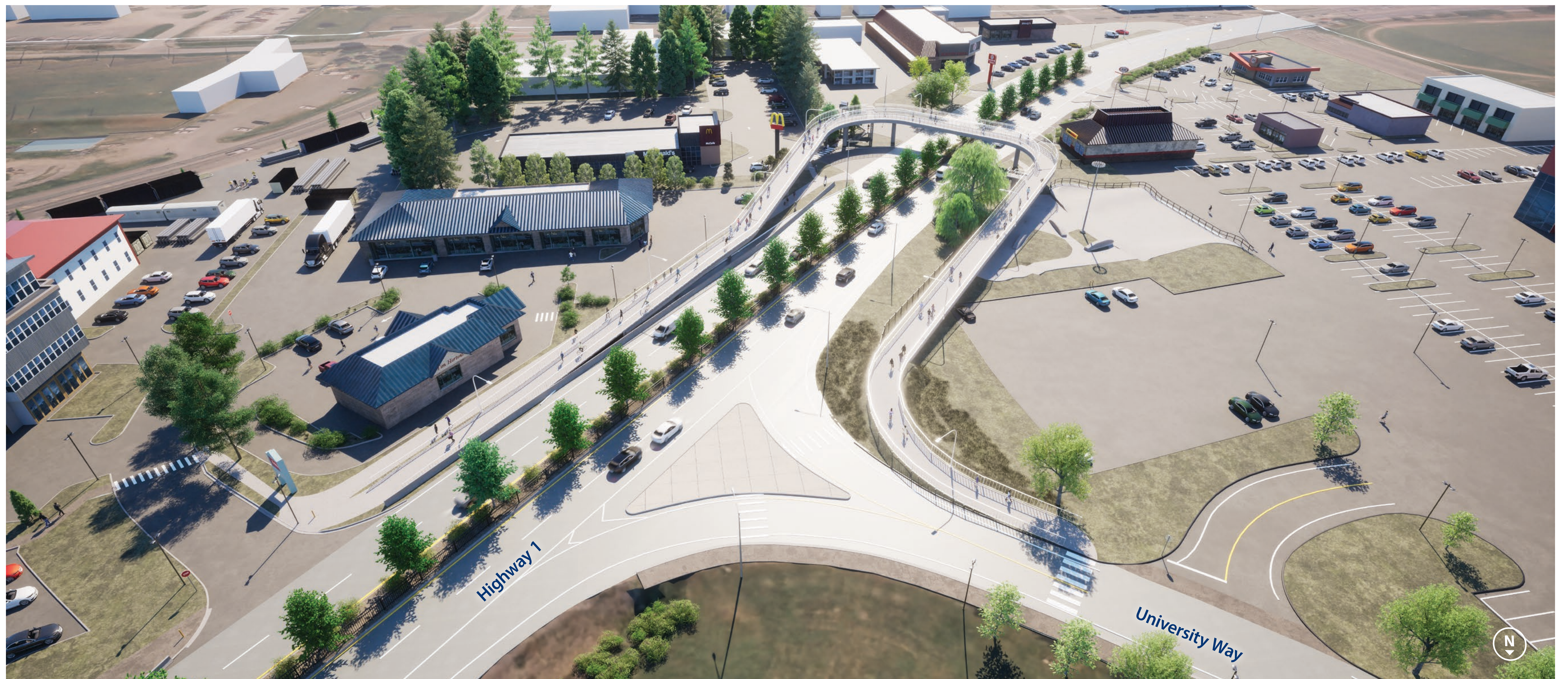
An artist's rendering of the North Cowichan Active Transportation Overpass, facing south. Rendering is conceptual and subject to change.