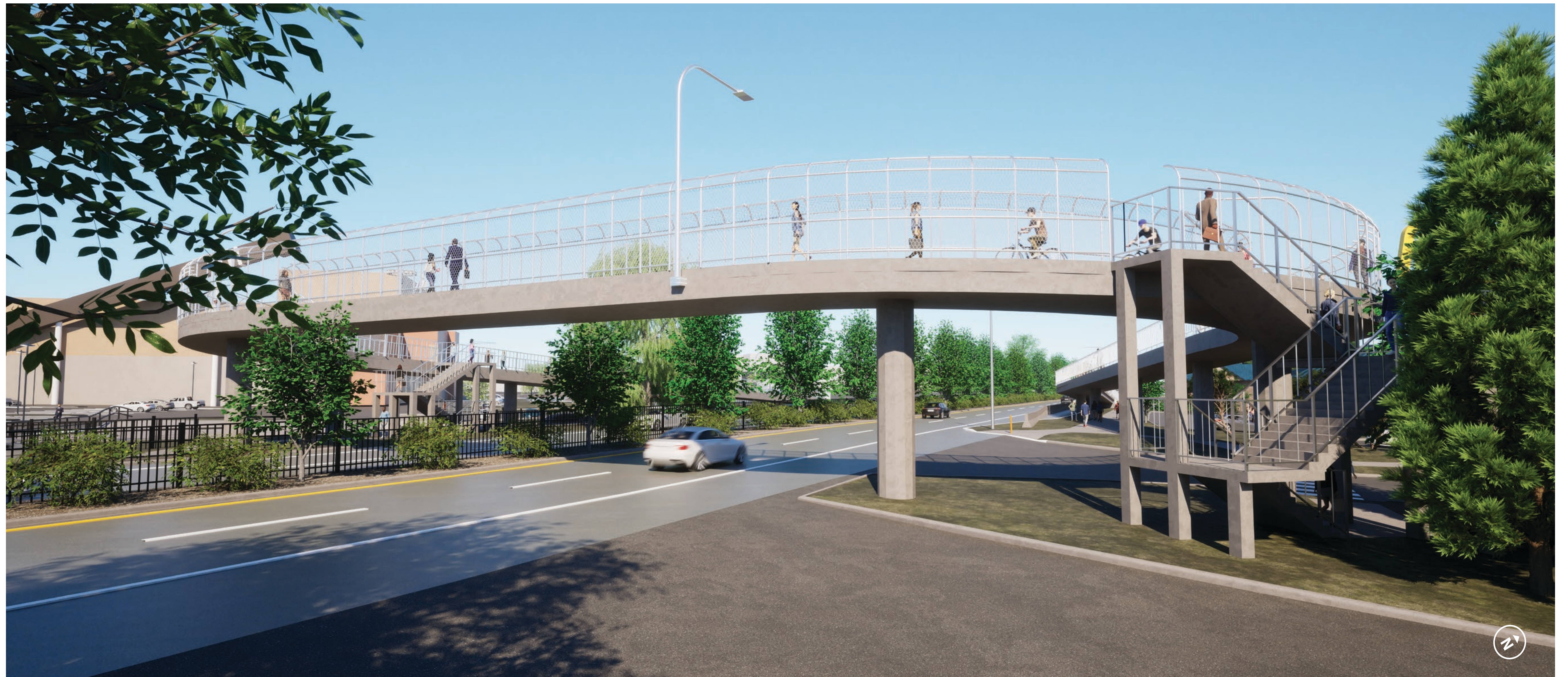
An artist's rendering of the North Cowichan Active Transportation Overpass from the ground, facing west. Rendering is conceptual and subject to change.