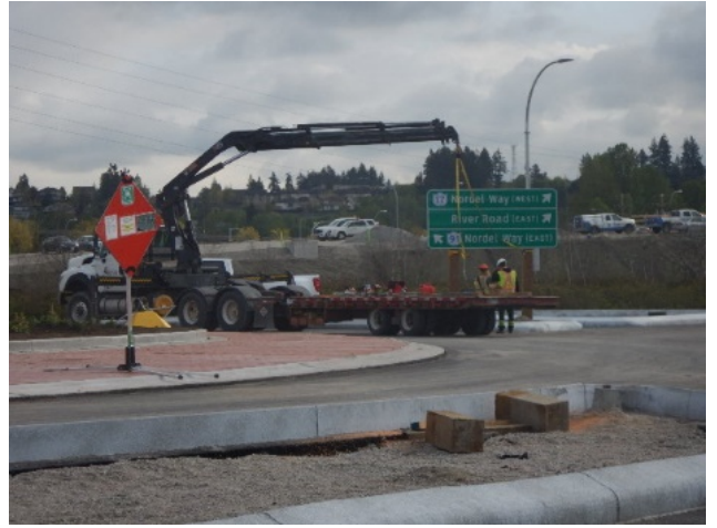
S3: Roundabout signage. Taken May 7, 2022