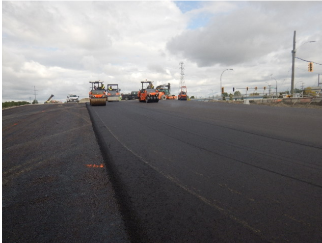
S3: East overpass approach. Taken May 7, 2022