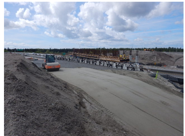
S4: Nordel overpass. Taken May 7, 2022