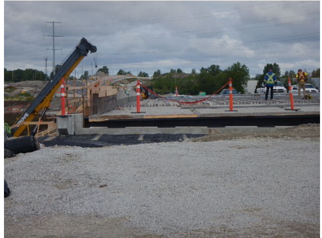
S3: Weigh Scale Overpass. Taken May 7, 2022