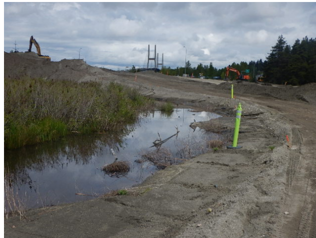
S4: Hwy 91 east side alignment sand removal. Taken May 7, 2022