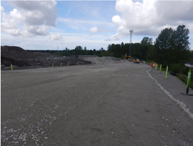
S2: Gravelling north of 96 th Street. Taken May 7, 2022