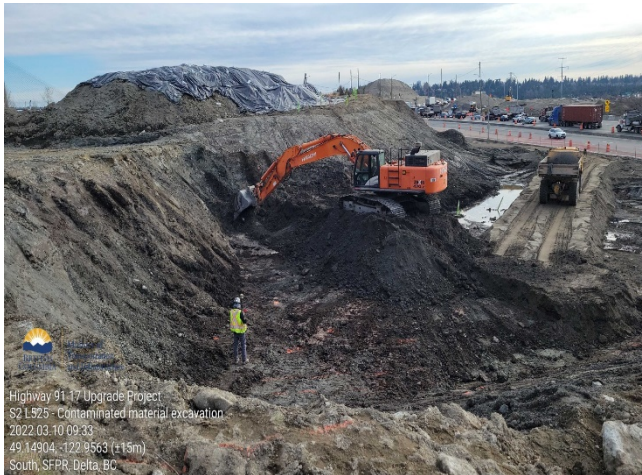
S2 – Contaminated material excavation. Taken March 10, 2022