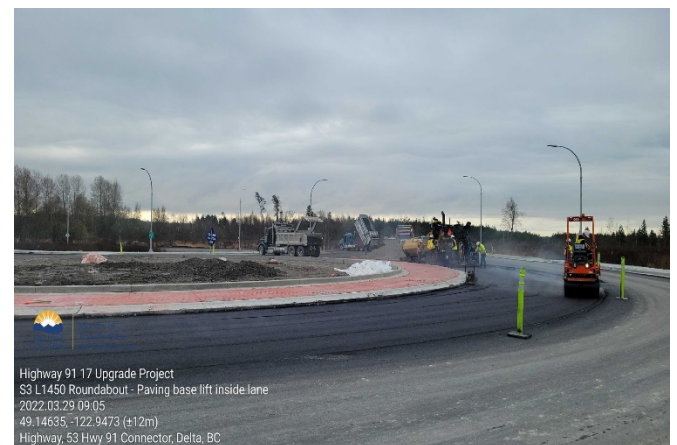
S3 – Roundabout paving base lift inside lane. Taken March 29, 2022