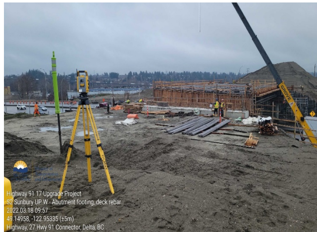
S2 – Sunbury Underpass West – Abutment footing, deck rebar. Taken March 18, 2022