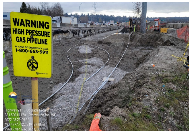
S3 – Excavation for LWF. Taken March 29, 2022