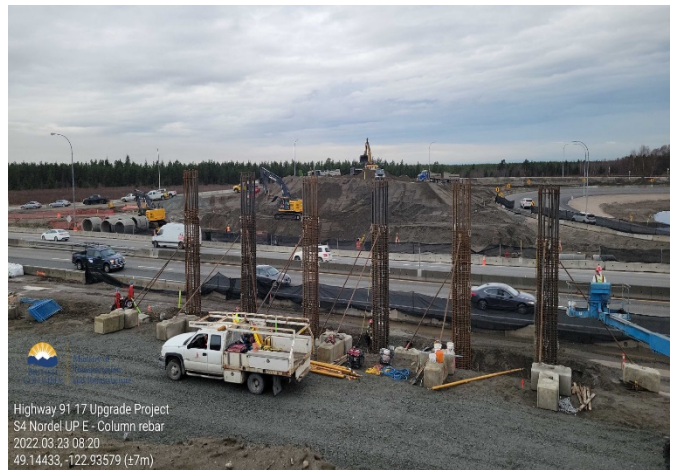
S4 – Nordel Underpass E – Column rebar. Taken March 23, 2022