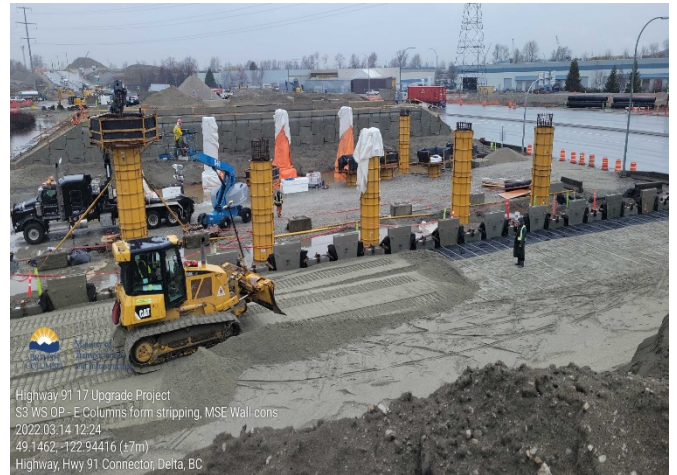
S3 – Westside overpass E columns form stripping; MSE walls construction. Taken March 14, 2022