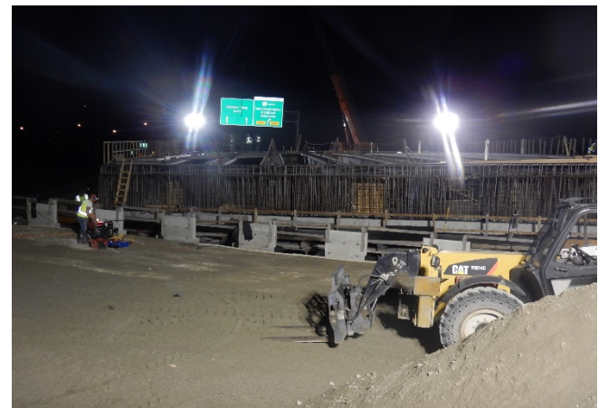
New Hwy 91 overpass deck panel install. Taken June 23, 2022