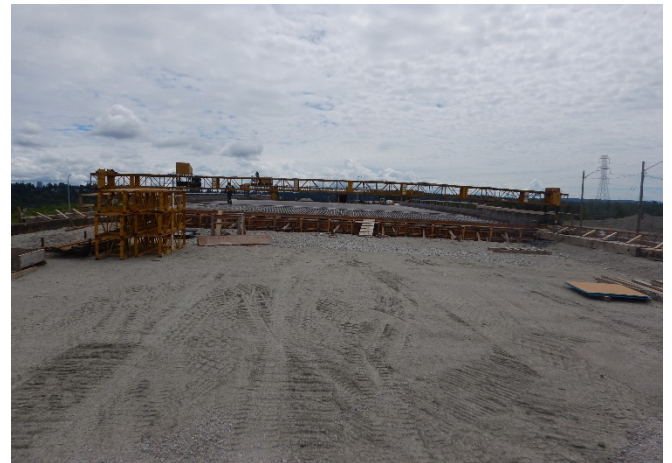
Hwy 17 overpass work. Taken June 11, 2022