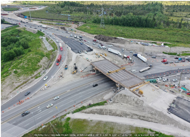
Hwy 17/Hwy 91C paving of east and west approaches; preparations for the deck concrete pour. Taken June 16, 2022