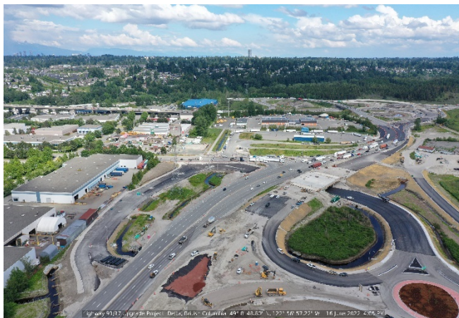
Hwy 91C/Nordel Way deck pour and paving of ramps. Taken June 16, 2022