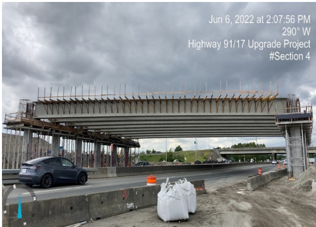
Hwy 91 and Nordel Interchange installation of girders for bridge structure. Taken June 6, 2022