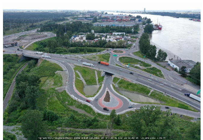
River Road/Hwy 17 final completion works. Taken June 16, 2022