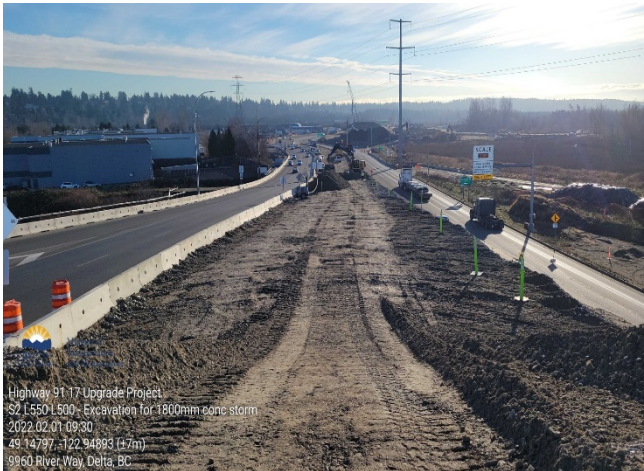
S2: Excavation for 1800mm conc storm. Taken February 1, 2022