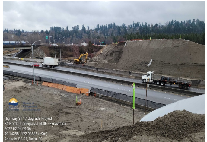
S4: Nordel underpass excavation. Taken February 4, 2022