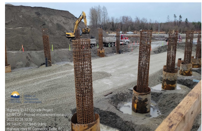
S3: Overpass preload embankment excavation. Taken February 28, 2022