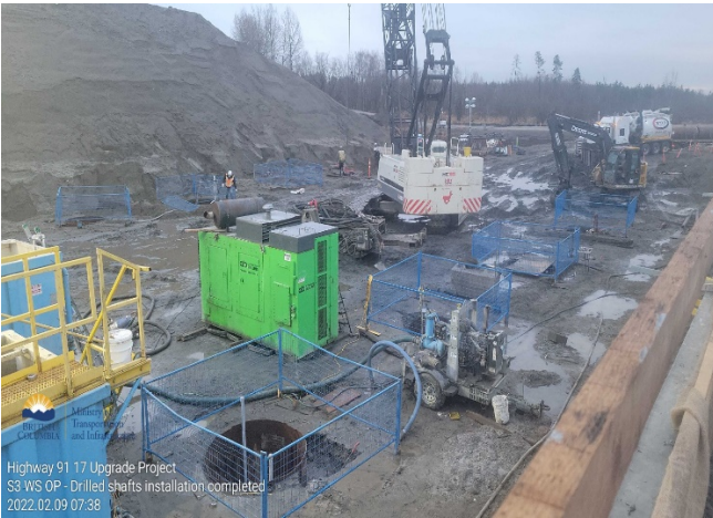
S3: Drilled shafts installation completed. Taken February 9, 2022