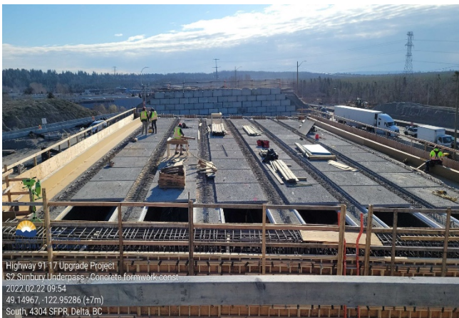
S2: Sunbury underpass concrete formwork construction. Taken February 22, 2022