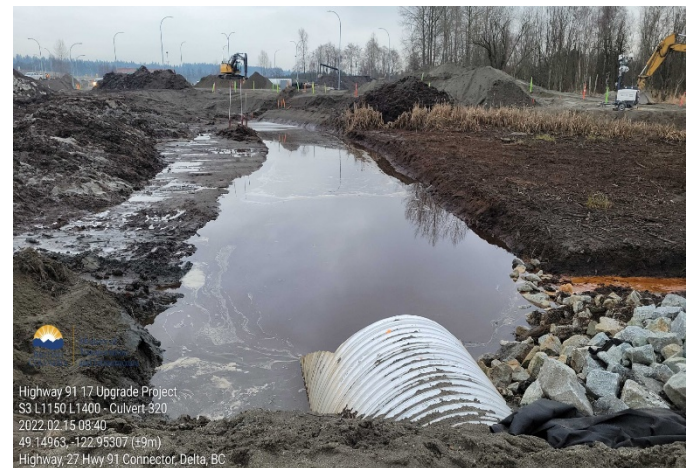
S3: Culvert 320. Taken February 15, 2022