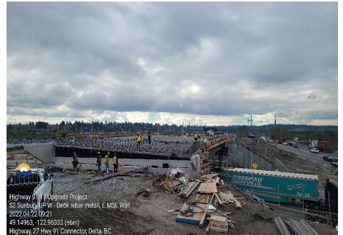
S2 – Sunbury Underpass west – Deck rebar install, E MSE Wall. Taken April 22, 2022