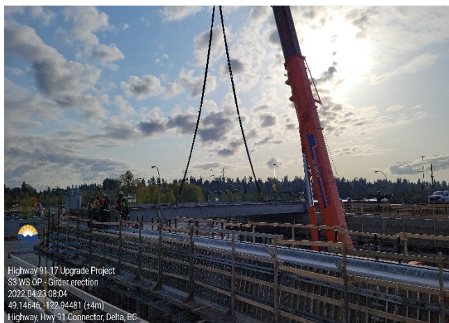
S3 – Westside overpass girder erection. Taken April 23, 2022