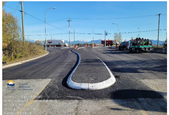
S1 – 96 th Street at River Road – Top lift asphalt paved. Taken April 20, 2022