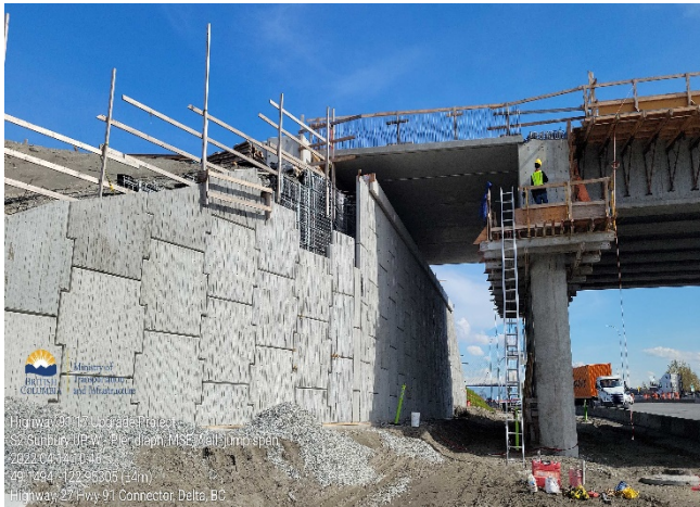
S2 – Sunbury Underpass west – Pier diaphragm, MSE Wall, jump span. Taken April 14, 2022