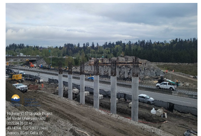
S3 – Nordel Underpass. Taken April 26, 2022