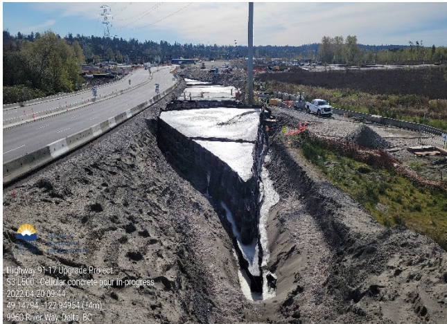
S3 – Cellular concrete pour in-progress. Taken April 20, 2022