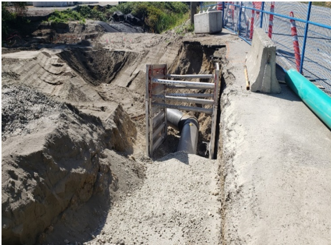
S1: River Road West Roundabout – Watermain Construction underway. Taken August 13, 2020