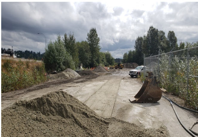
S4: BCTFA Property – Watermain Construction underway. Taken August 20, 2020