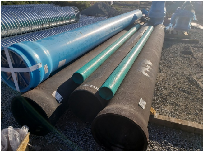
S1: River Road West Roundabout – Watermain Construction – Materials on-site, awaiting installation. Taken August 4, 2020