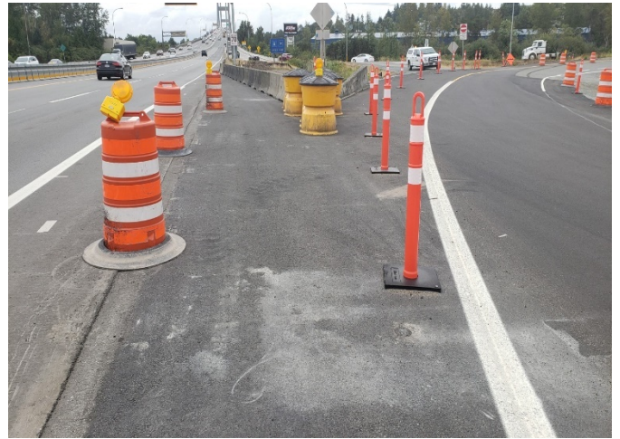
S4: E01 Detour – Hwy 91 NB Exit 8 awaiting diagonal line painting within gore area. Taken August 7, 2020