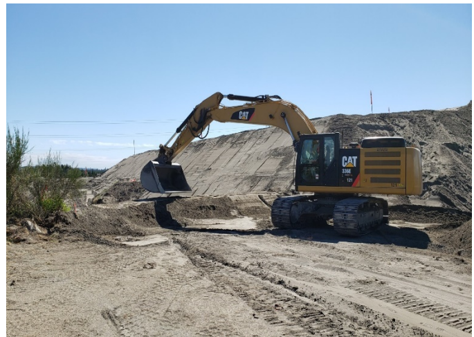
S2: L500/L575 – A PGC excavator cutting the placed preload/embankment fill slopes. Taken August 18, 2020