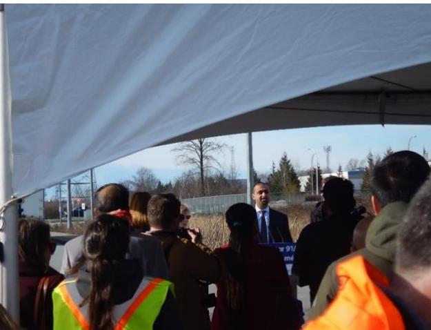
Ground-breaking Media Event (Feb. 14, 2020)