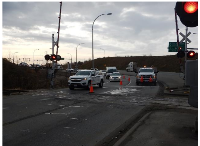
96th Street BNSF Crossing Repairs (Feb. 24, 2020)