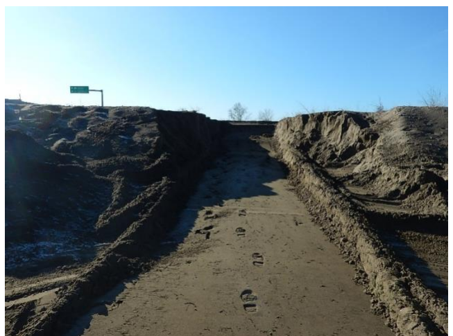
Segment 1 Preload (Feb. 28, 2020)