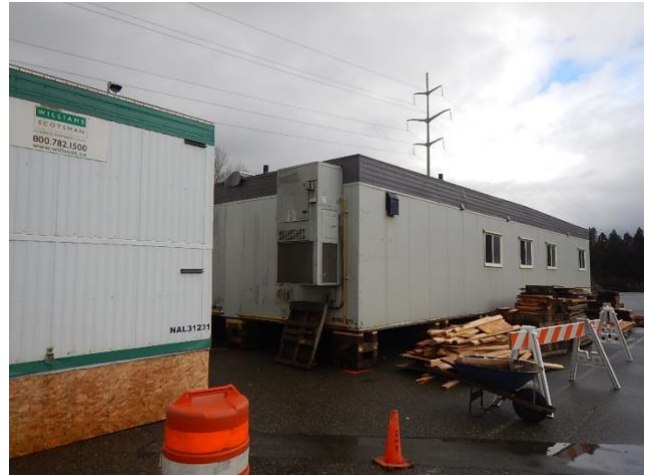
Site Office Construction (Feb. 13, 2020)