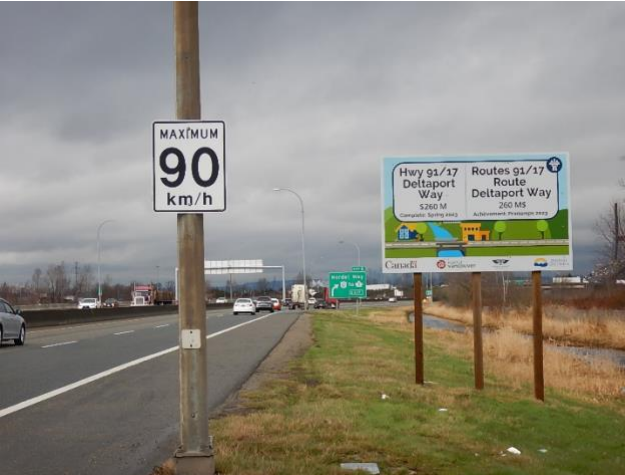
Hwy 91/17 Sign to Nordel Way (Feb. 13, 2020)