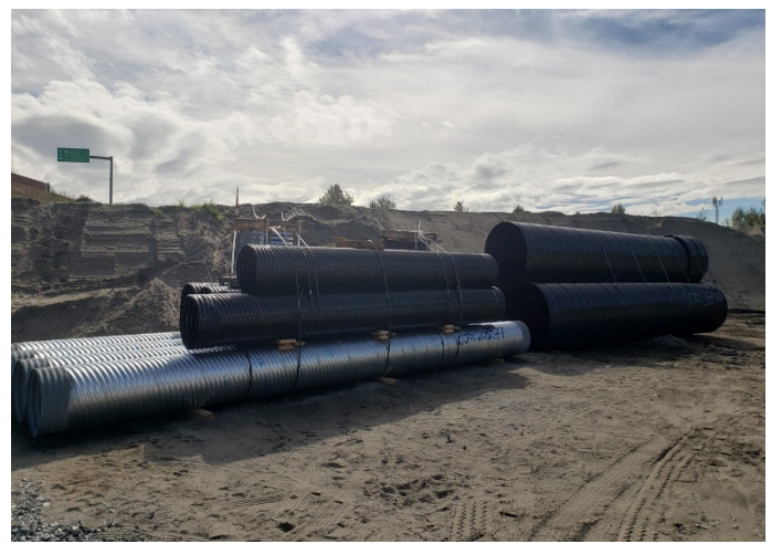
S1 (River Rd West Roundabout): Several sizes, and variations of CSP culverts have arrived. Taken September 22, 2020