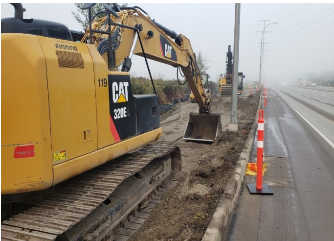
S3 (Hwy 91C/C01 Detour South): Embankment fill placement ongoing during night shift. Taken September 16, 2020