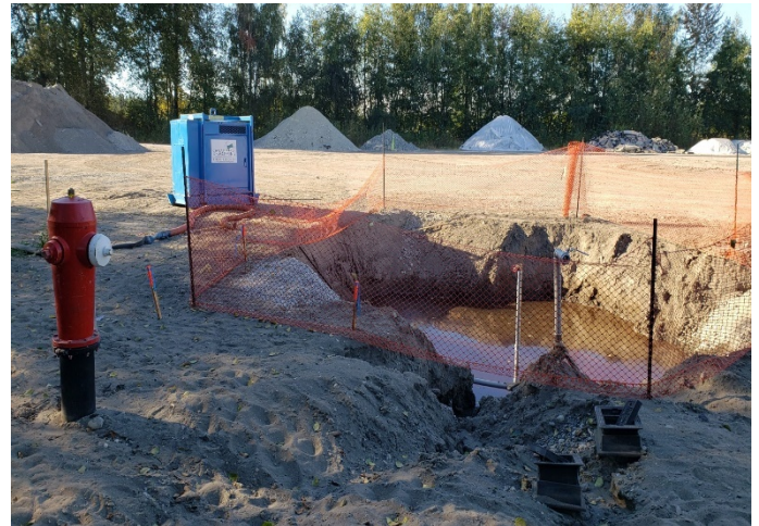
S4 (BCTFA Property): Flooded open excavation of the East Watermain tie-in. Taken September 8, 2020