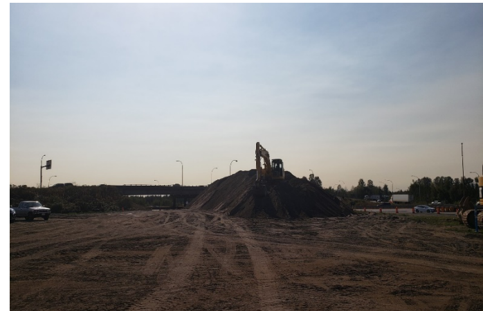
S4 (Hwy 91NB Off-ramp Laydown Area): Various material stockpiles and waste piles being stored and consolidated on a regular basis. Taken September 30, 2020