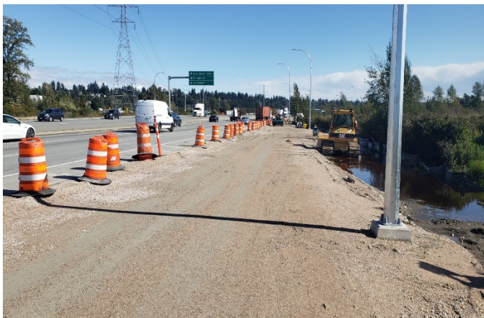
S2/S3 (Hwy 91C/C01 Detour South): The road widening construction has reached the top of the road base gravel layer. Taken September 25, 2020