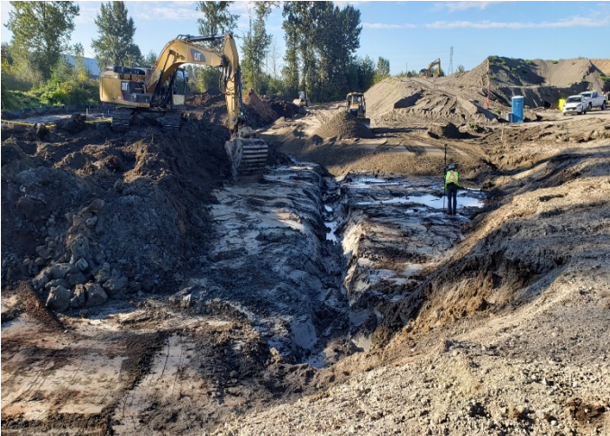
S1 (River Rd East Roundabout/W01 Detour): Excavation and Preload/embankment fill placement. Taken September 3, 2020