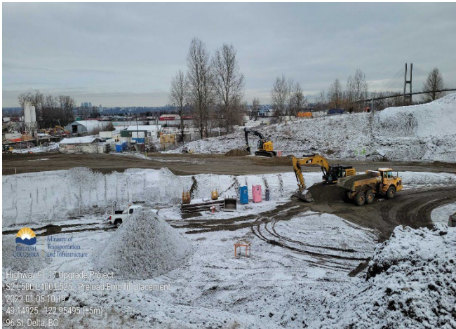
S2: Preload embankment fill placement. Taken January 1, 2022