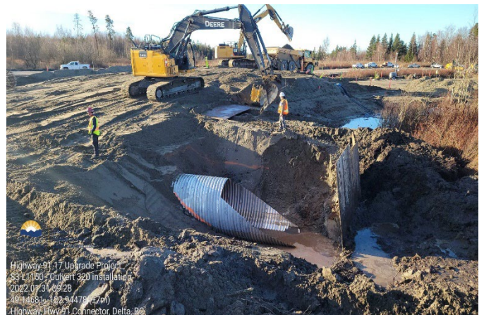
S3: Culvert 320 installation. Taken January 31, 2022