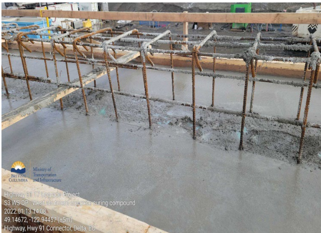
S3: West abutment concrete curing compound. Taken January 13, 2022