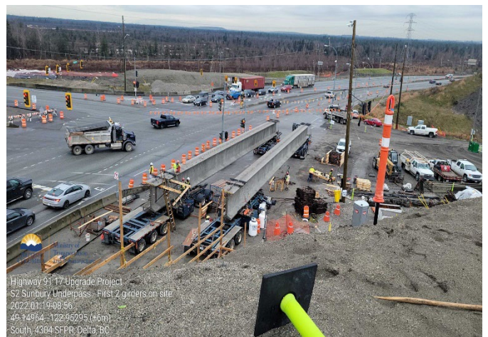
S2: First 2 girders on site for Sunbury structure. Taken January 19, 2022