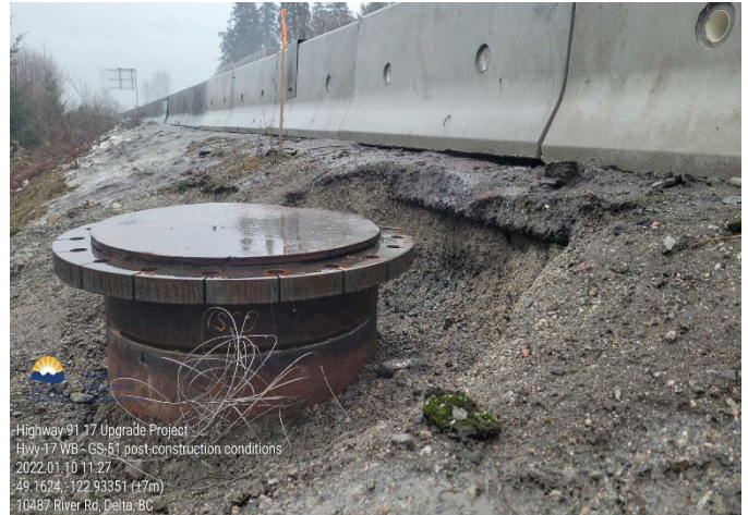
Hwy 17 WB - Guide sign post-construction conditions. Taken January 10, 2022