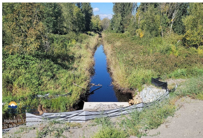
S1: River Road Overpass foundation excavation. Taken September 23, 2021