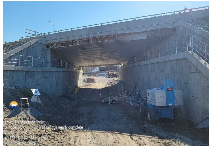
S1: River Road structure MSE Wall railings nearly complete. Taken September 7, 2021