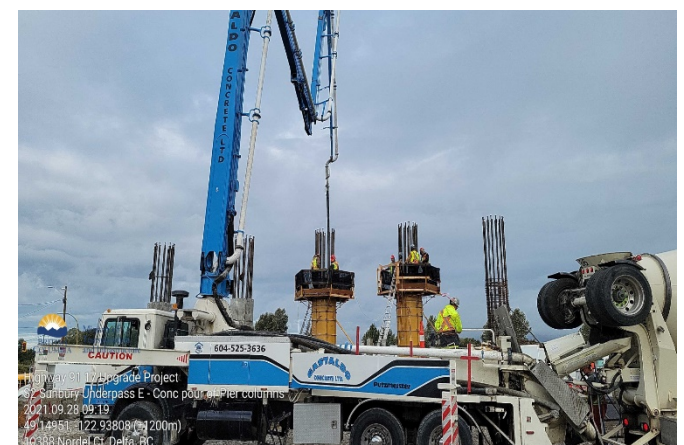
S2 Sunbury structure concrete pour of pier columns. Taken September 28, 2021