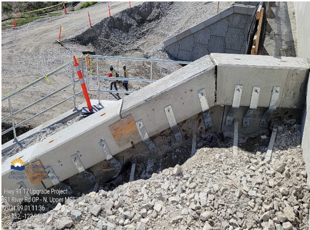
S1: River Road structure N. upper MSE Wall. Taken September 1, 2021