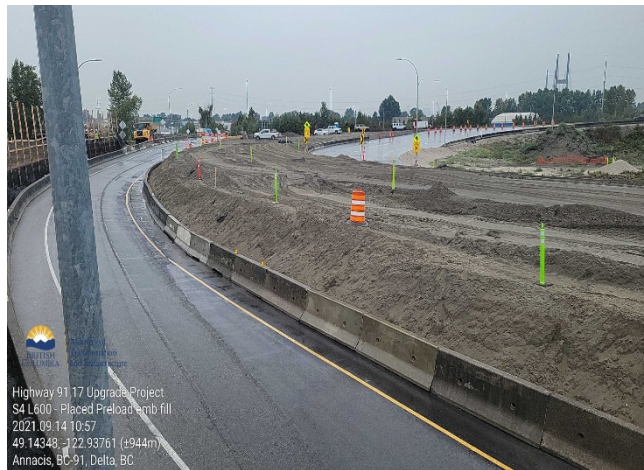
S4: Placed preload embankment fill. Taken September 14, 2021