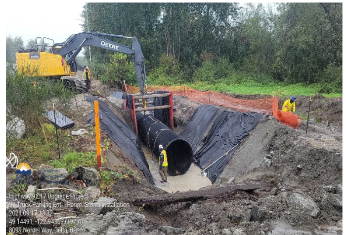
S3: Truck parking perim. storm installation. Taken September 17, 2021