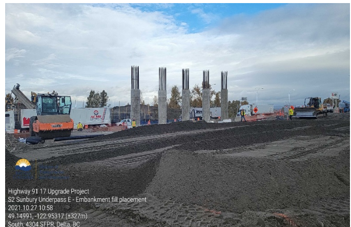
S1: Sunbury structure east - embankment fill placement. Taken October 27, 2021