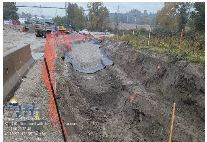
S1: Ditch lined with membrane, clear crush. Taken October 20, 2021