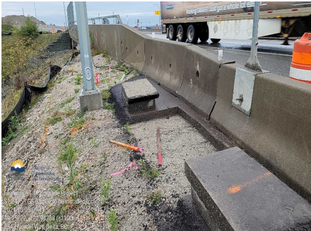
S1: Guide sign pile to be installed. Taken October 5, 2021