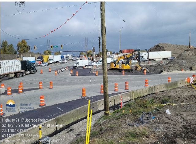
S2: Hwy 17/91C I/C - New asphalt pavement. Taken October 18, 2021