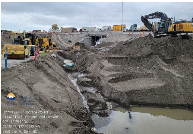
S1: Wetland pond excavation. Taken October 25, 2021