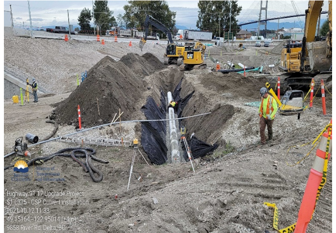
S1: CSP Culvert installation. Taken October 12, 2021