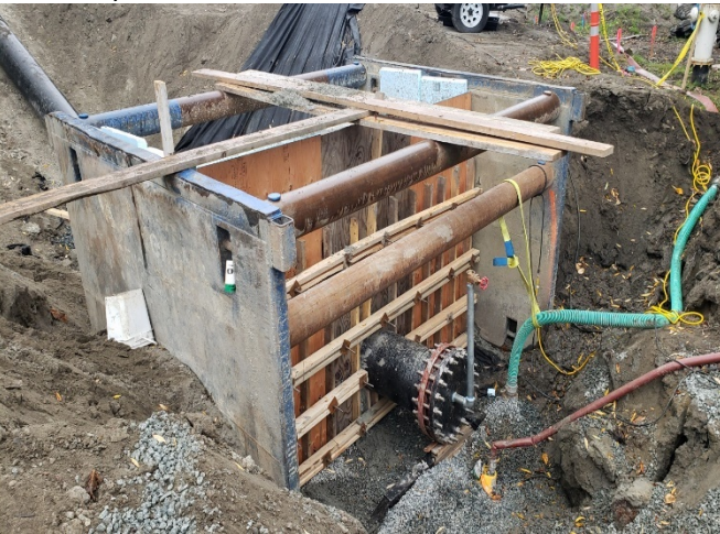
S1: Concrete formwork in place for concrete pour of thrust block for water main install. Taken October 9, 2020