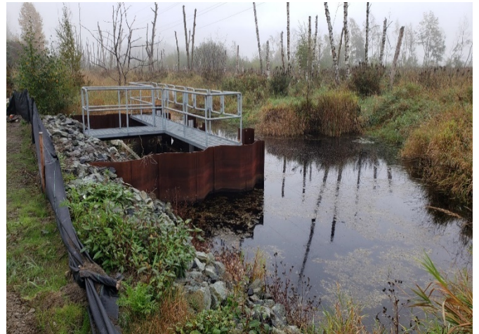
S2: Existing EW Ditch running along the South side of Hwy 17. Taken October 5, 2020