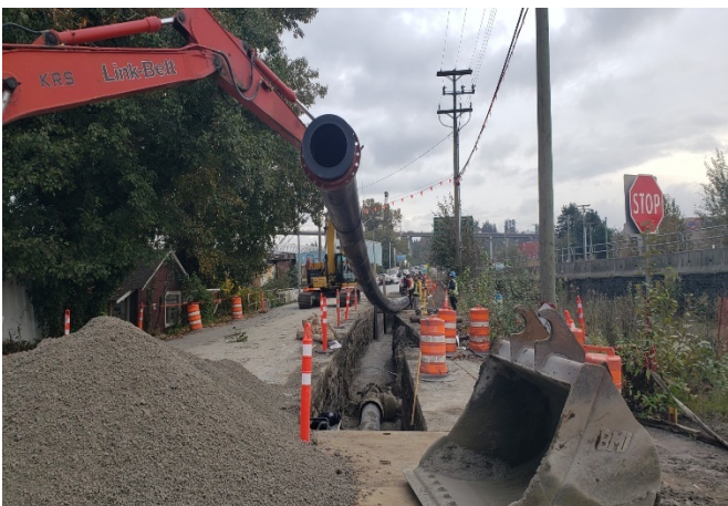
S1: Last length of 500mm dia. HDPE water main being lowered into place Taken October 20, 2020