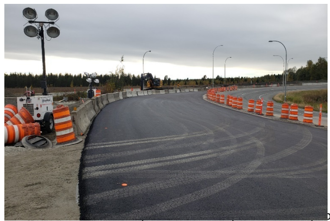
Nordel Way EB. Taken October 28, 2020