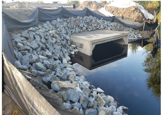
S2: Box culvert installation complete at 96 St. Ditch on North side of Hwy 17. Taken October 14, 2020