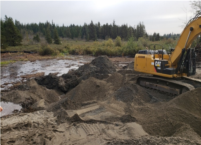
S4: Delta Nature Reserve Peat excavation and backfilling underway - Taken October 1, 2020