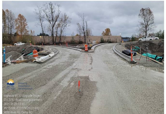
S1: Road base placement. Taken November 9, 2021