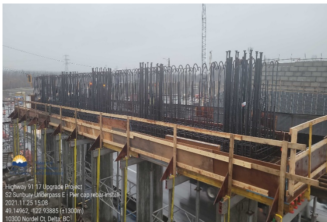
S2: Sunbury structure east - Pier cap rebar install. Taken November 25, 2021