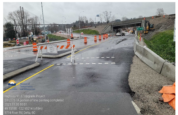
S1: A portion of line painting completed. Taken November 30, 2021