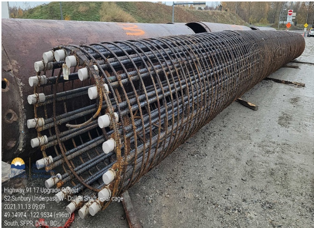
S2: Sunbury structure west - Drilled shaft rebar cage. Taken November 13, 2021