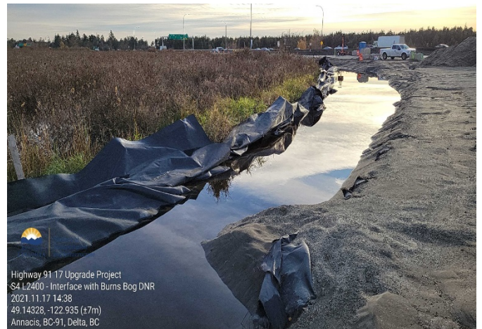
S4 Interface with Burns Bog Delta Nature Reserve. Taken November 17, 2021