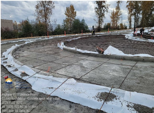
S1: East roundabout - concrete apron rebar install. Taken November 2, 2021