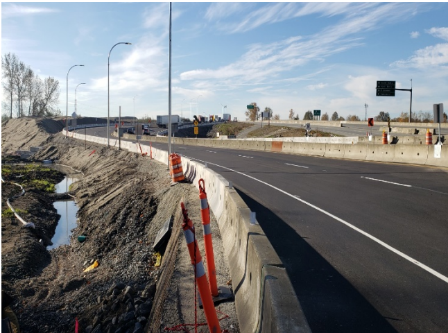
S1 (W01 Detour): The W01 Detour, now fully implemented with traffic running WB & EB. Taken November 2, 2020