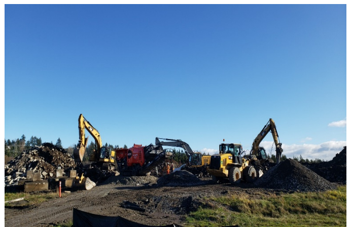
S4 (Laydown Area): PGC excavators feeding a jaw crusher with broken concrete removed from various locations on the Project Site. Taken November 30, 2020