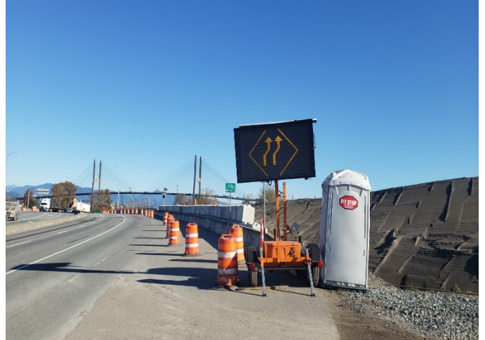
S2 (Hwy 17 EB): A DMS sign notifying Hwy 17 EB traffic of the upcoming lane shift. Taken November 6, 2020