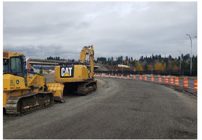
S4 (L2200): Equipment along the inside of the Hwy 91SB off-ramp to Nordel Way EB loop. Taken November 20, 2020