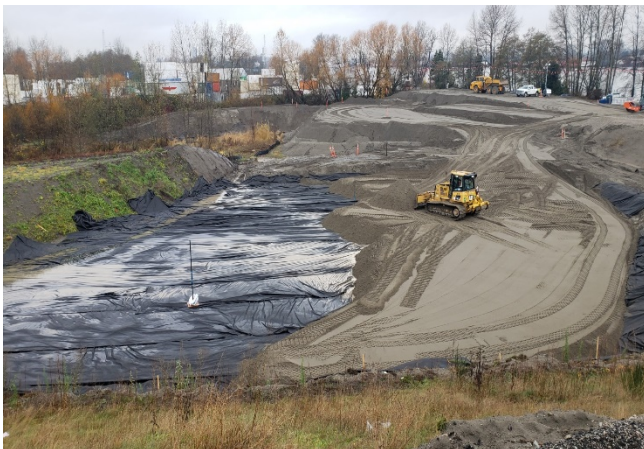
S1 (River Rd. West): A PGC dozer spreading preload/embankment fill over top of laid filter fabric along the L250 alignment. Taken November 26, 2020