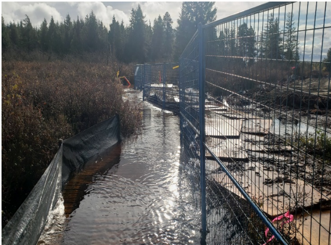
S4 (Delta Nature Reserve): Flooding due to a combination of a King tide and recent heavy rainfall. Taken November 13, 2020