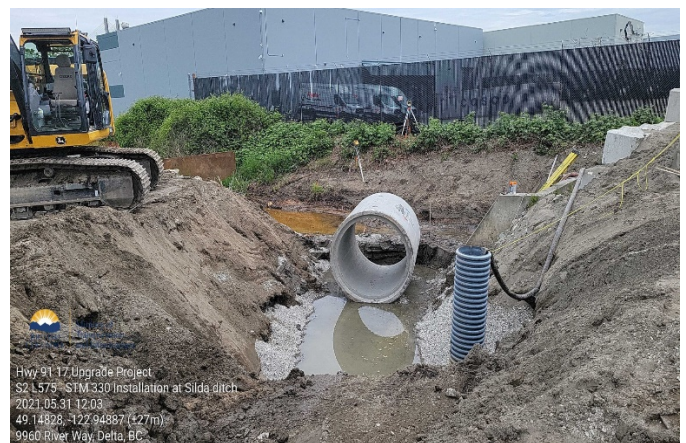
S2: L325 Storm 330 installation at Silda Ditch. Taken May 31, 2021