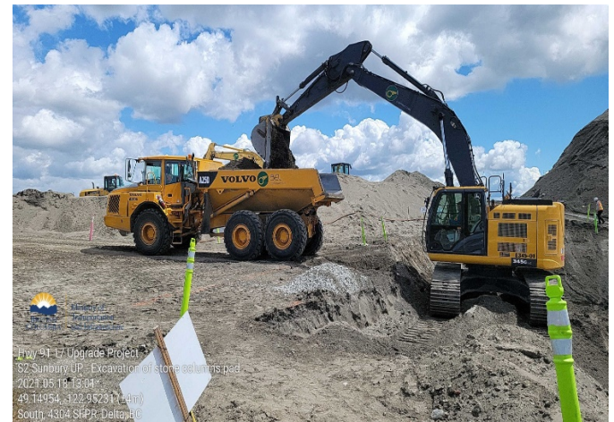
S2: Sunbury structure excavation of stone columns pad. Taken May 18, 2021