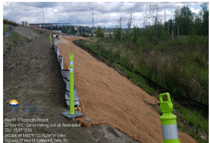
S2: Hwy 91C Cocoa matting, and silt fence install. Taken May 7, 2021