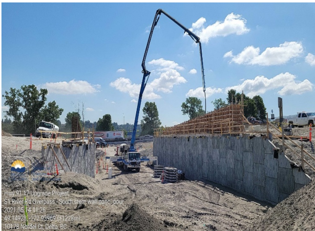
S1: River Road Structure - South stem wall concrete pour. Taken May 14, 2021