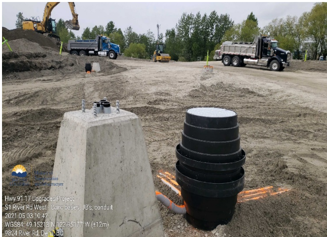
S1: River Road West - Concrete bases. Taken May 3, 2021