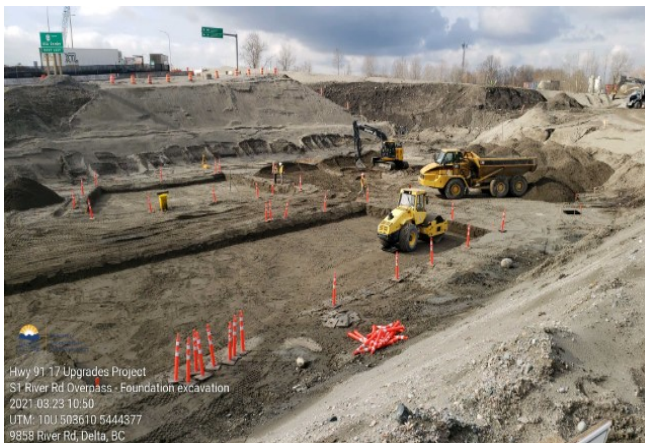
S1: River Road structure south upper East MSE wall. Taken May 26, 2021