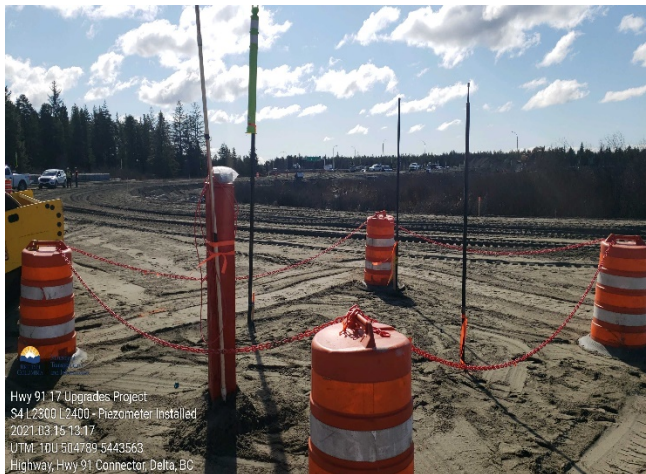
S4: Hwy 91 east side piezometer installation. Taken March 15, 2021