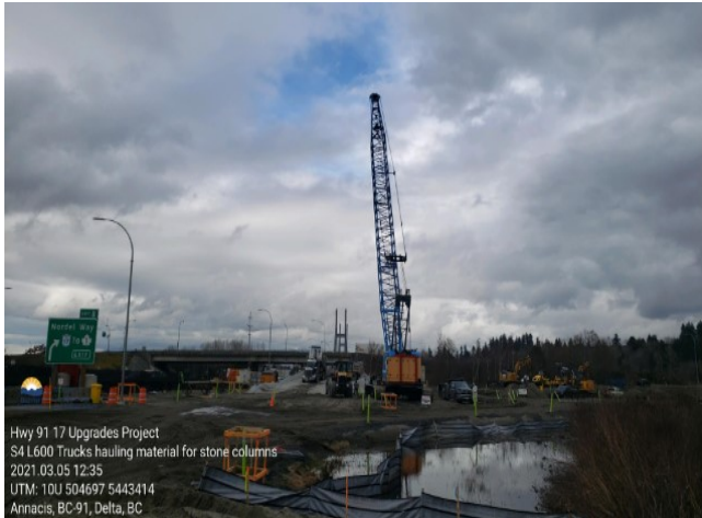
S4: Hwy 91 east side trucks hauling material for stone columns. Taken March 5, 2021