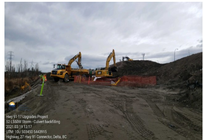
S2: Hwy 17 west storm-culvert backfilling. Taken March 18, 2021