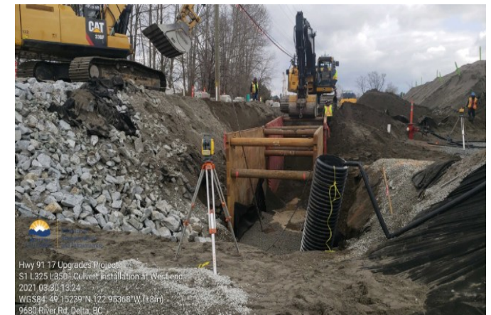
S1: Hwy 17 west culvert installation at West end. Taken March 25, 2021