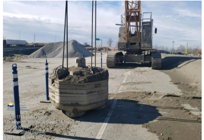
S1: Liebherr HS 855 Crawler Crane and 15.5 Ton weight. Taken March 8, 2021