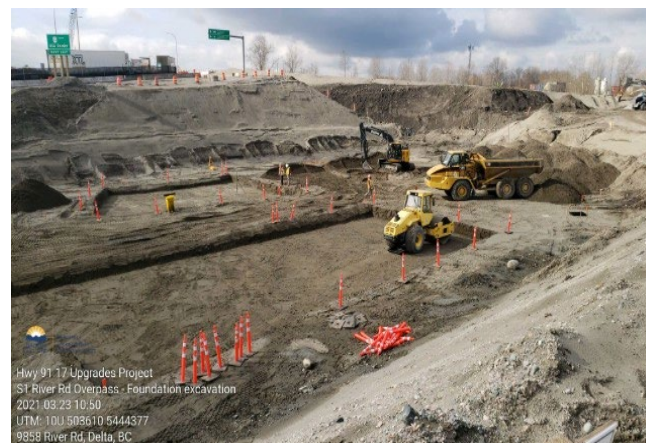
S1: River Road Overpass foundation excavation. Taken March 23, 2021