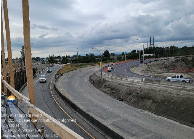
S4: Hwy 91 West Side - 2 lanes open to traffic along alignment. Taken June 14, 2021