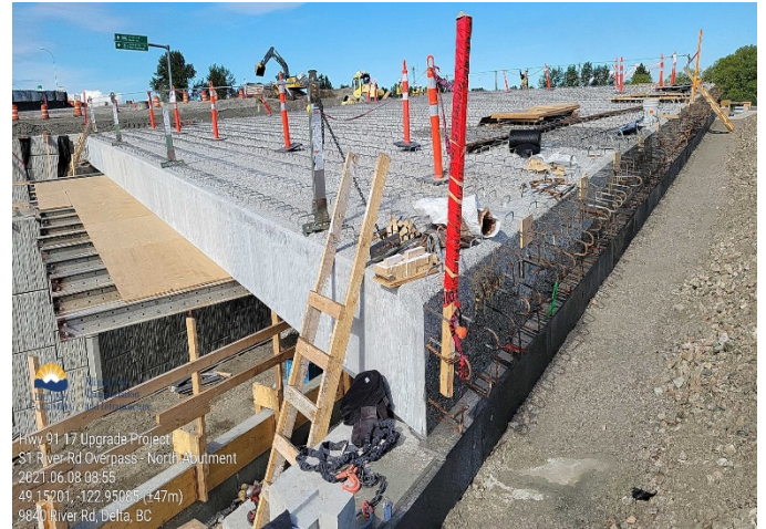
S1: River Road Structure - North Alignment. Taken June 8, 2021