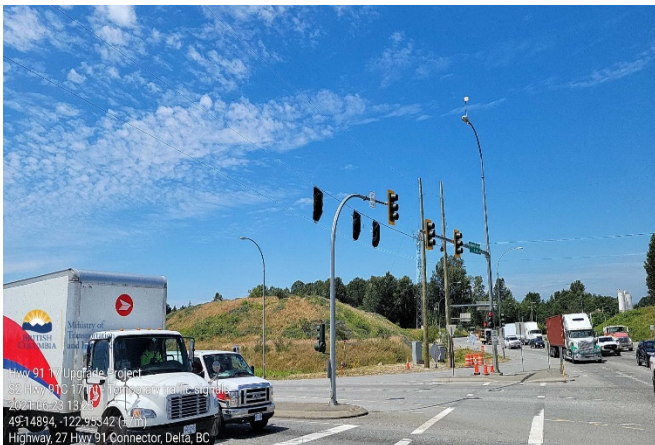
S2: Hwy 91C 17 Interchange - Temporary traffic signals. Taken June 23, 2021