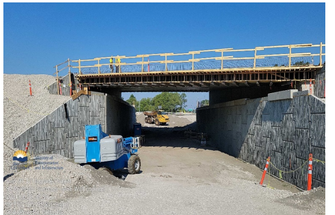
S1: River Road structure - MSE Wall copings. Taken June 29, 2021