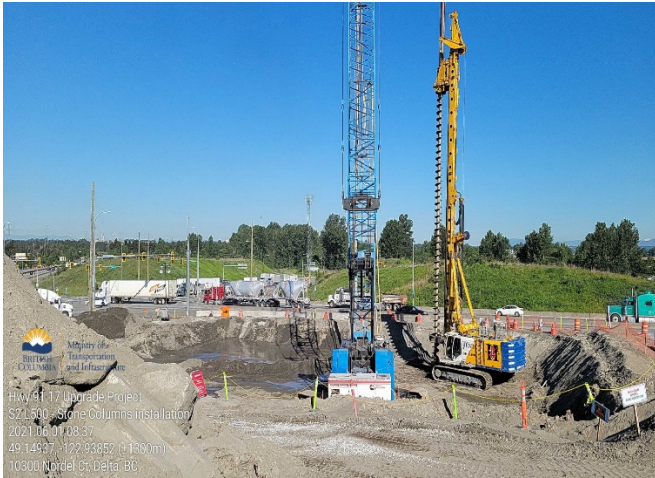
S2: Sunbury Underpass Stone Columns installation. Taken June 1, 2021