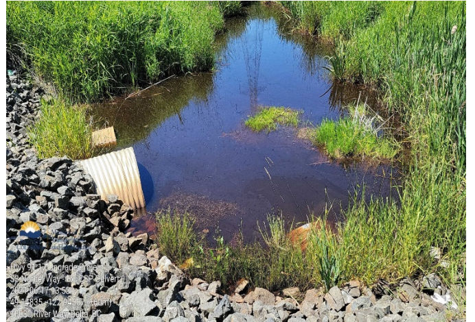
S3: Nordel Way - Ex. CSP Culvert. Taken June 17, 2021