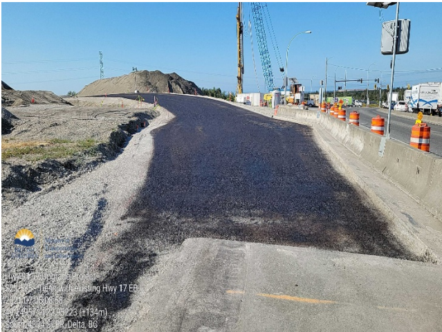
S2: Tie-in with existing Hwy 17 EB. Taken July 5, 2021