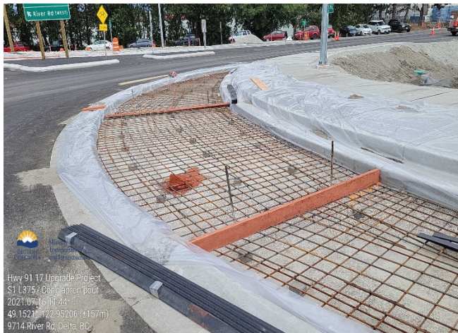
S1: Concrete apron pour. Taken July 16, 2021