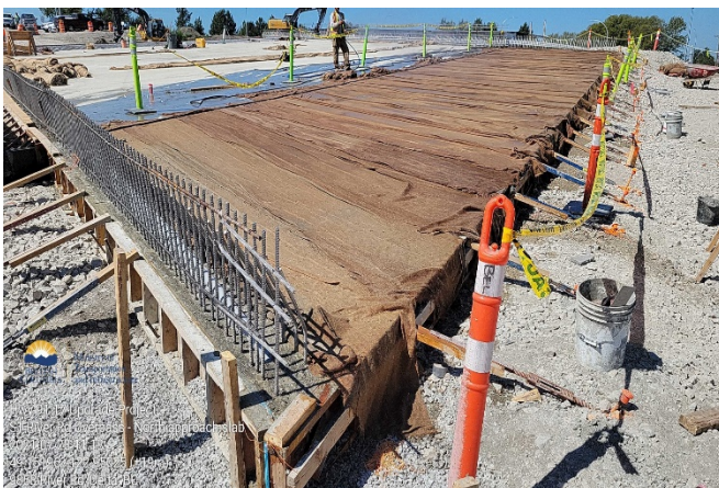
S1: River Road structure North approach slab. Taken July 28, 2021