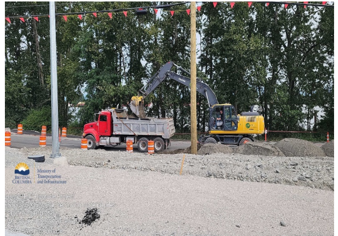
S1: Removing material piles. Taken July 8, 2021