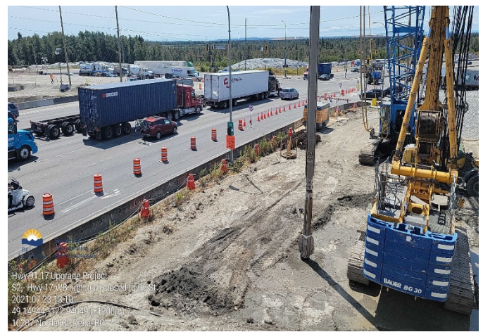
S2: Hwy 17 WB right turn to 96 th street. Taken July 23, 2021