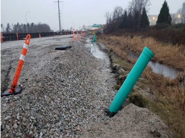
S3: Hwy 91C – Northern limit of construction interface with existing East-West ditch. Taken January 4, 2021