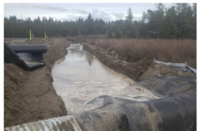
S4: Hwy 91 East Side – Width of excavation along toe of fill. Taken January 29, 2021