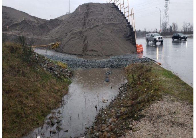
S2: Hwy 17 EB > Hwy 91C EB – Some on-site ponding with the increased rain. Taken January 8, 2021