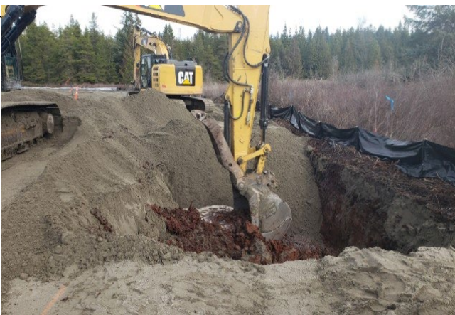
S4: Hwy 91 East Side – Full peat excavation underway at toe of fill. Taken January 26, 2021