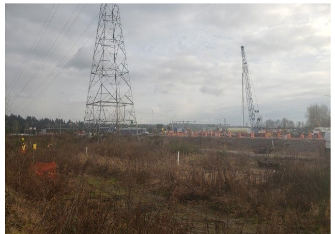
S3: Hwy 91C North/Fortis ROW – Clearing & Grubbing underway. Taken January 20, 2021