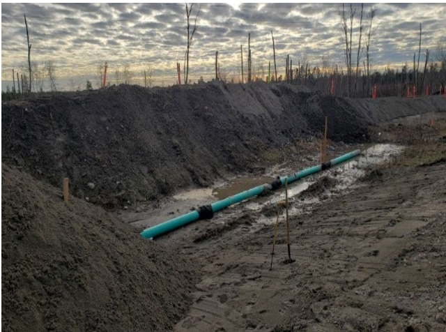
S2: Hwy 17 EB > Hwy 91C EB – Some on-site drainage measures in place during preload/embankment fill placement. Taken