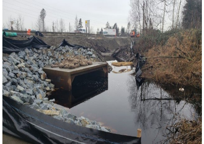
S2: Hwy 17 West – Box Culvert at 96 St. Ditch. Taken February 4, 2020