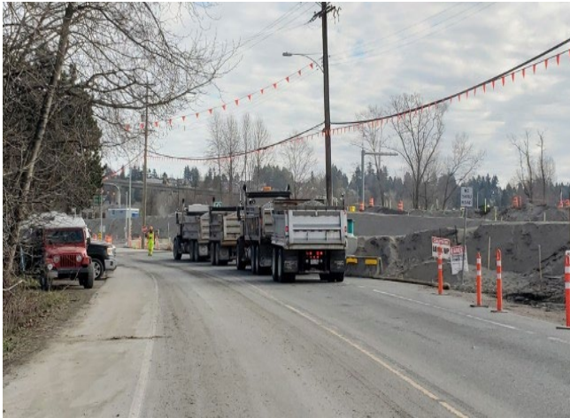
S1: River Road embankment fills on ramps and roundabout. Taken February 9, 2021