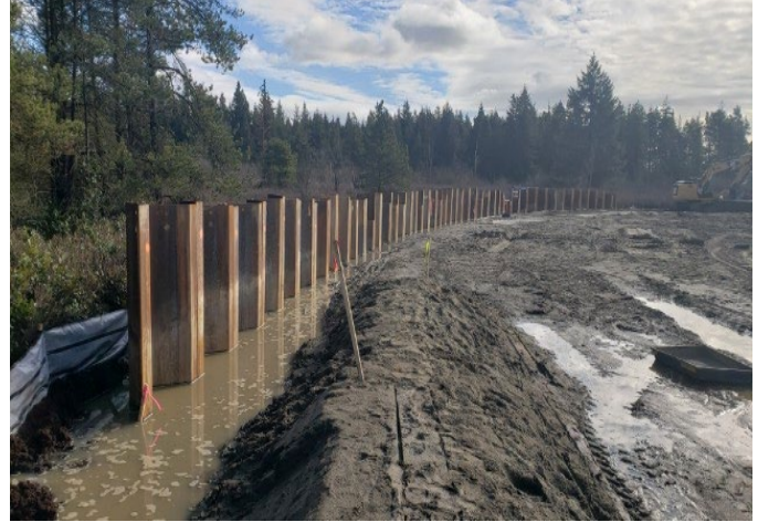
S4: Hwy 91 East Side – FRPD have completed the temporary sheet pile wall installation. Taken February 16, 2021