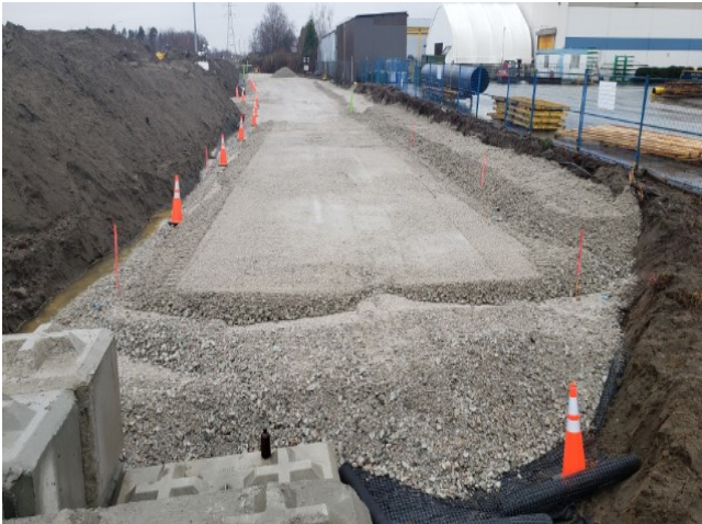
S3: Hwy 91C North - Lifts of 3" road sub-base placed as preload. Taken February 1, 2021