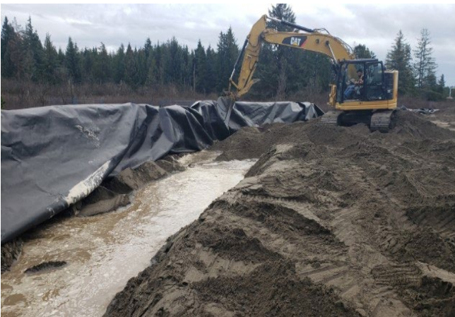
S4: Hwy 91 East Side – PGC laying the geomembrane within the toe kick excavation and backfilling. Taken February 22, 2021