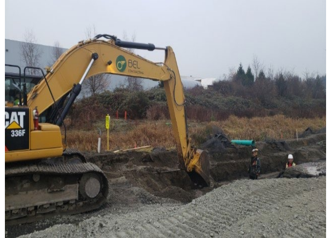
S3 Sunbury - East – Excavation for further cellular concrete lightweight fill. Taken December 7, 2020