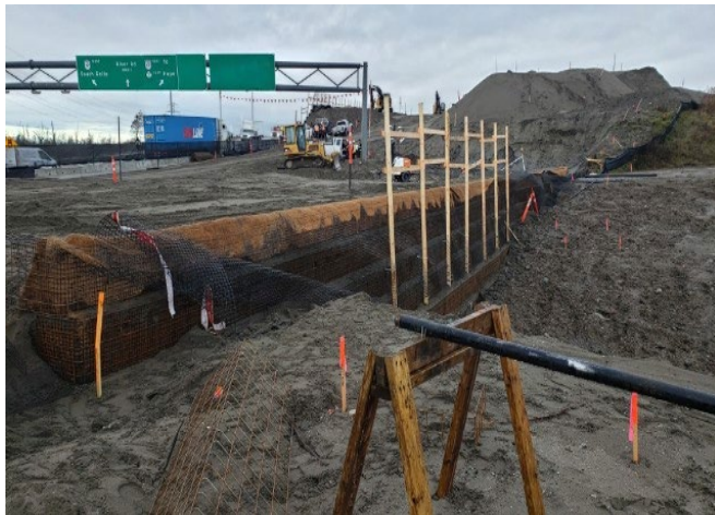
S2 Hwy 91C/17 I/C – Construction of the sloped wall. Taken December 9, 2020