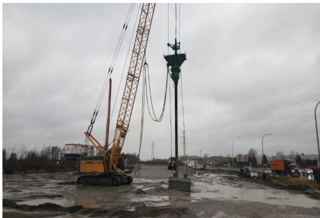
S3 Weigh Scale Overpass – Stone Columns installation using the DBF method. Taken December 18, 2020