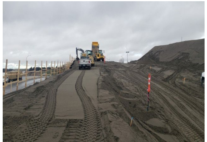
S2 Hwy 91C/17 I/C – Preload/embankment fill placement ongoing. Taken December 15, 2020