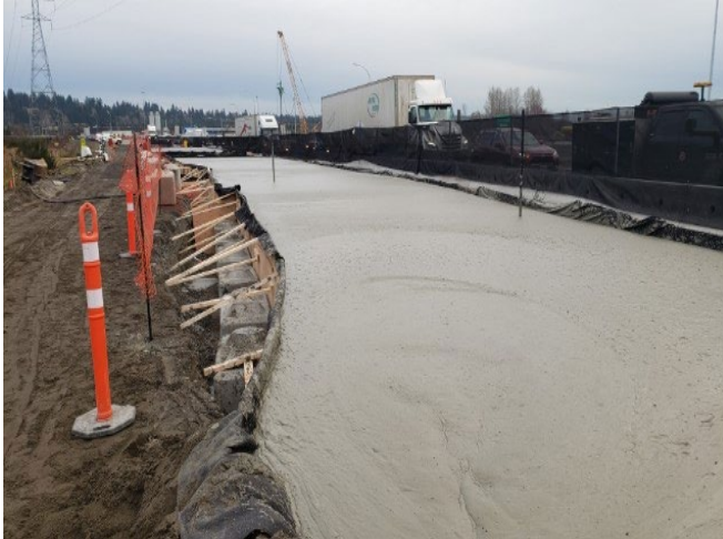
S3 Sunbury - East – Cellular concrete lightweight fill along top of the existing Fortis gas mains. Taken December 3, 2020