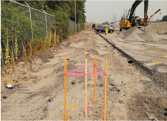
S3: Nordel Truck Pkg – Survey layout for Storm work. Taken August 13, 2021