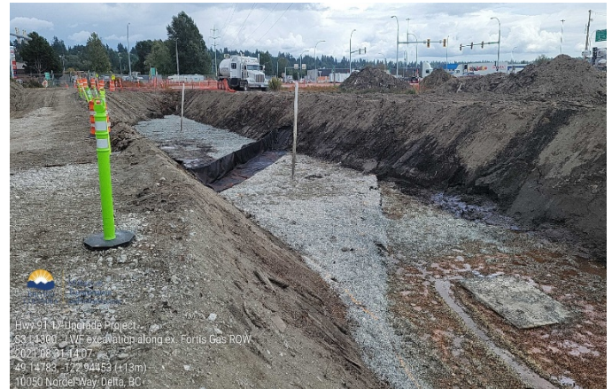
S3: LWF excavation along ex. Gas ROW. Taken August 31, 2021