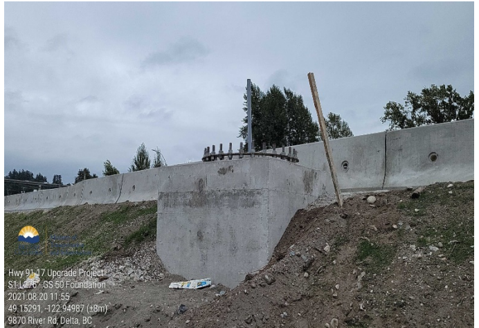
S1: Guide sign 50 foundation. Taken August 20, 2021