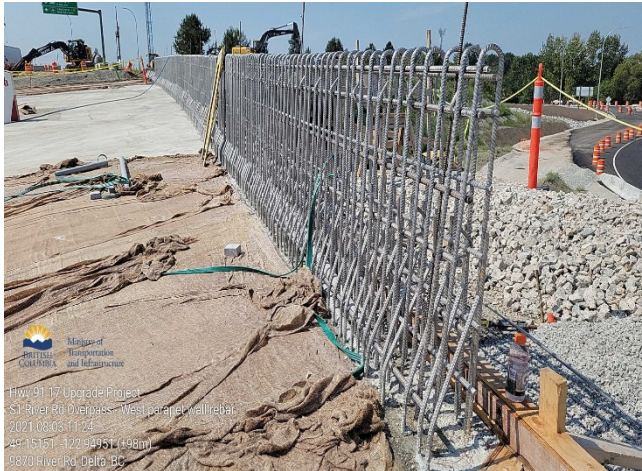
S1: River Road structure – West parapet wall rebar. Taken August 1, 2021