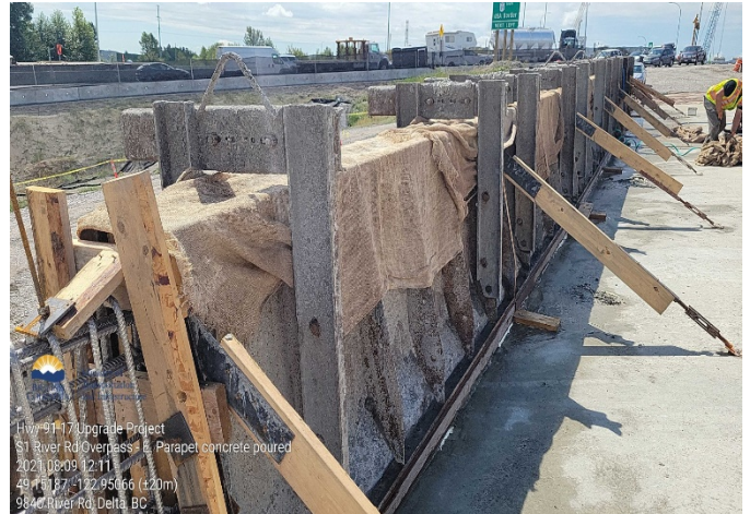
S1: River Road structure – East parapet concrete poured. Taken August 8, 2021