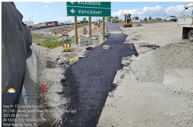
S1: newly paved River Rd structure East app. Taken August 30, 2021