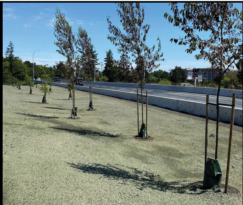
Figure 5: Hydroseeding and new trees planted along the median