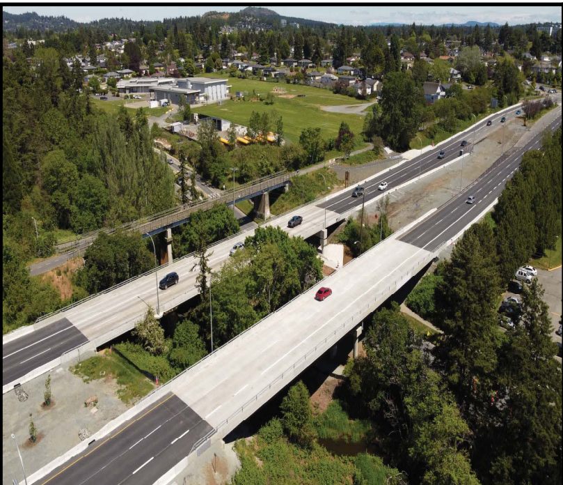
Figure 4: Drone image of project site (looking North-East)