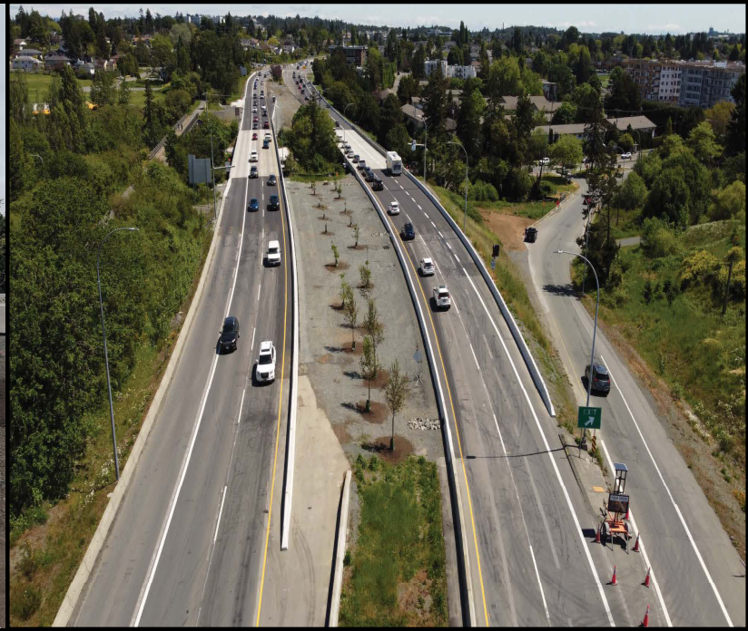
Figure 3: Drone image of project site (looking East)