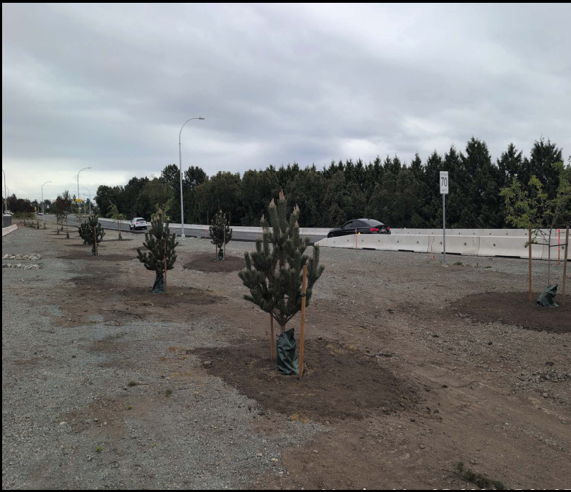
Figure 2: New trees planted in the median