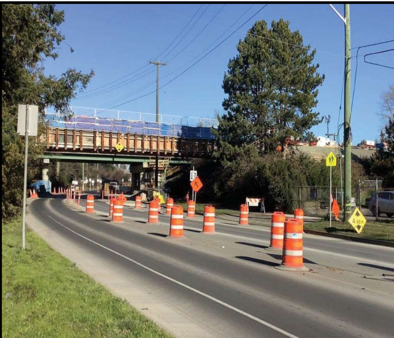
Figure 4: Traffic Management Along Burnside Road