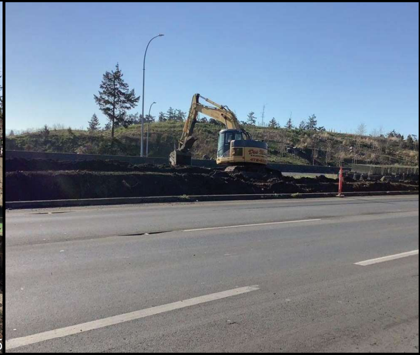
Figure 3: Works Along West Median on Highway 1