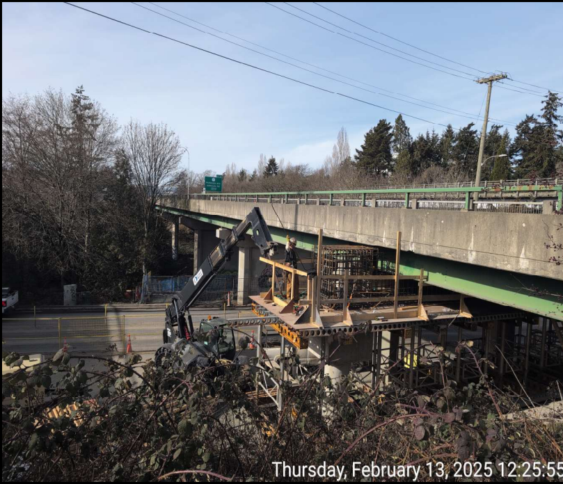
Figure 2: Work Along North Bridge Bent