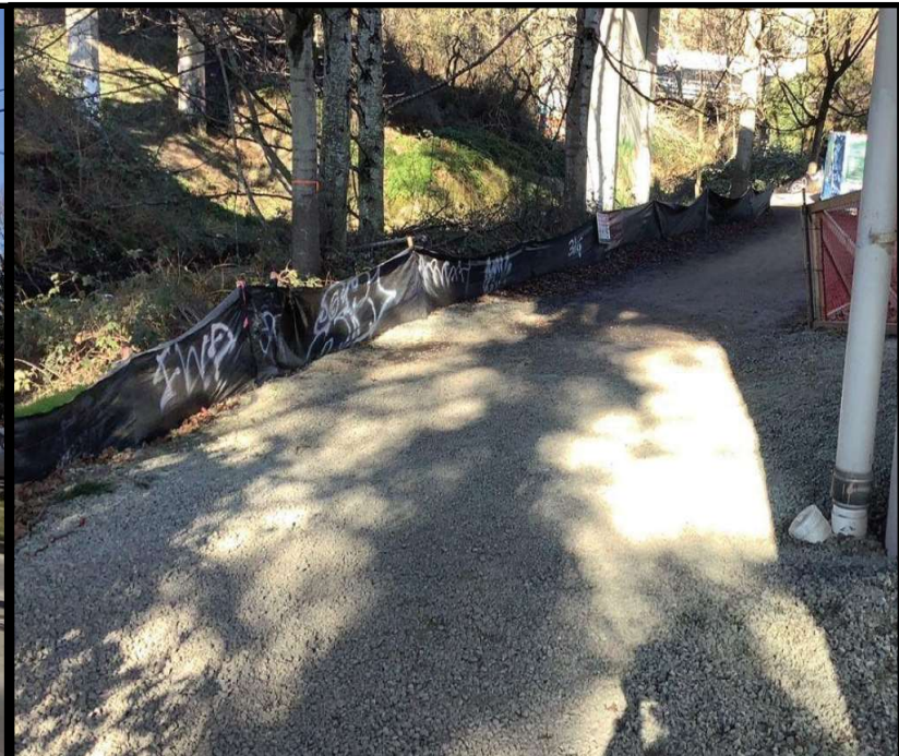
Figure 5: Silt Fencing Along Multi-Use Path