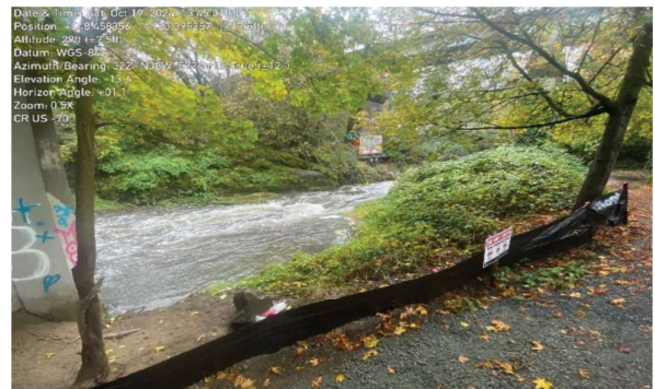
Figure 1: Colquitz River During Atmospheric River Event

The Project site survived the October 2024 atmospheric river event that resulted in flash flooding throughout Vancouver Island. Water level and turbidity were perceivably higher during the event.