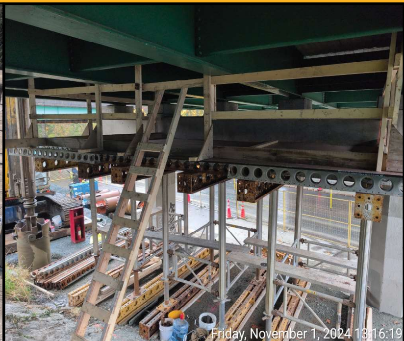
Figure 3: North Bridge Structural Works