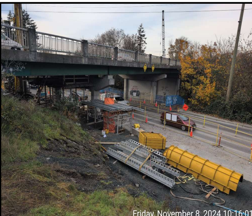
Figure 4: North Bridge Pile Installation