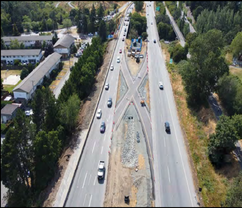
Figure 2: Overhead View of Median Cross Over

Ministry of Transportation and Infrastructure