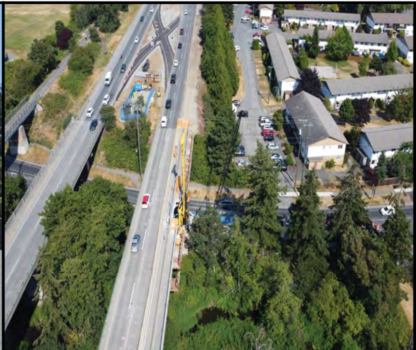
Figure 5: Overhead View of South Bridge Pile Installation