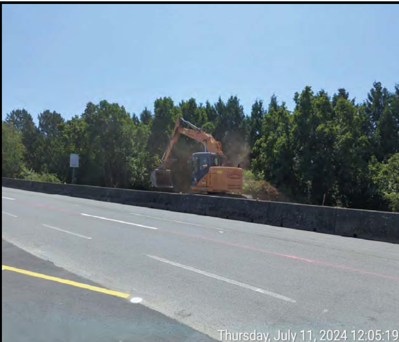
Figure 4: Works Along Highway 1