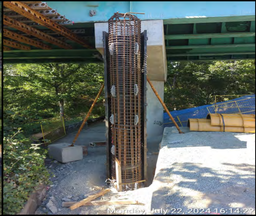
Figure 3: Pile Installation at South Bridge