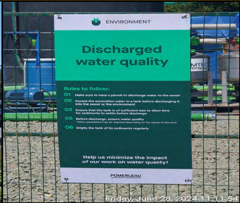
Figure 3: Discharged Water Quality Signage at the Water Treatment Area