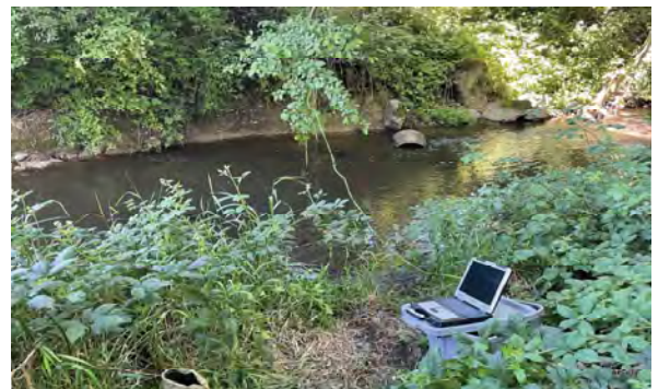
Figure 1: Hydrophone Setup During Piling Activities

During the pile installation process, environmental monitors have setup hydrophone and vibration monitoring in the Colquitz River. Hydrophone and vibration readings detect acoustic signals under the water. These readings are compared to guidelines recommended by Fisheries and Oceans Canada to minimize the potential of Project related changes in underwater noise conditions that can affect aquatic life.