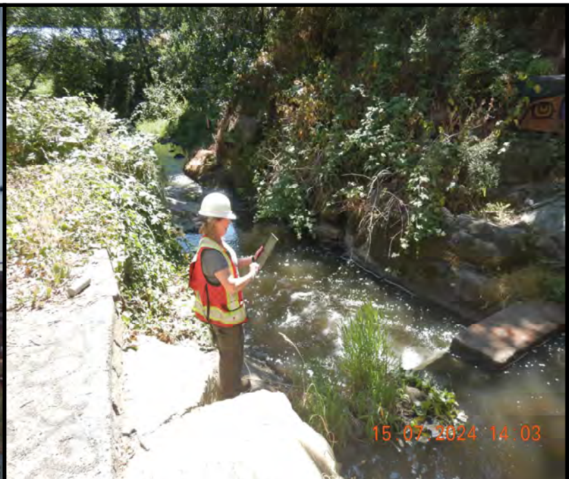
Figure 5: MOTI Auditor Conducting Water Quality Data as Part of a Routine Audit