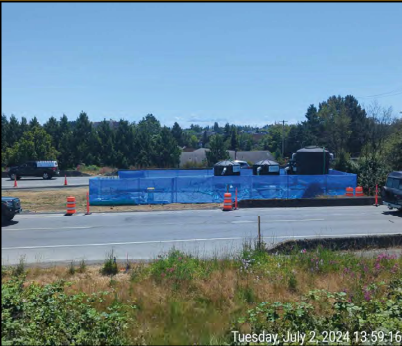
Figure 2: Water Treatment Area Setup

Ministry of Transportation and Infrastructure