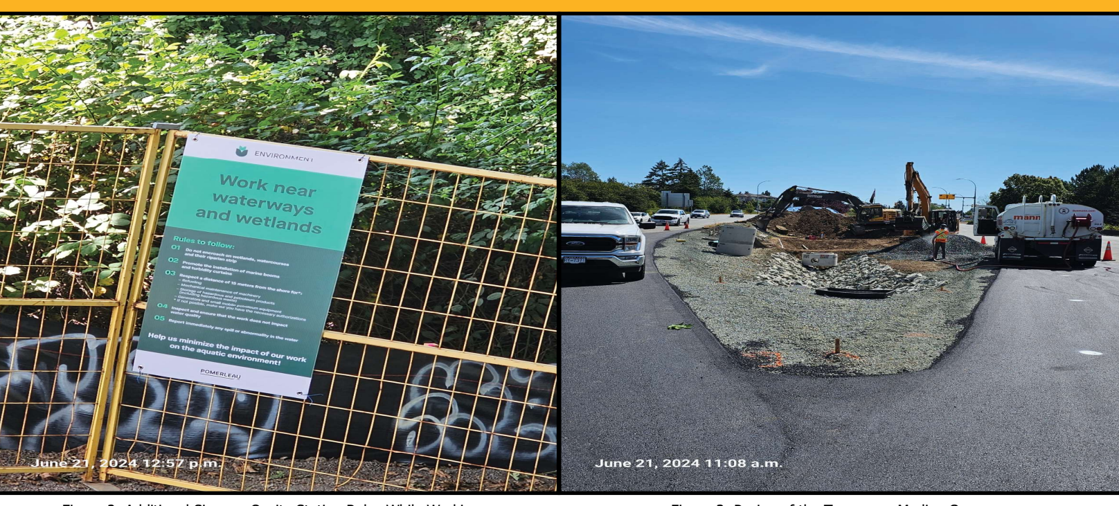
Figure 2: Additional Signage Onsite Stating Rules While Working Near the Colquitz River