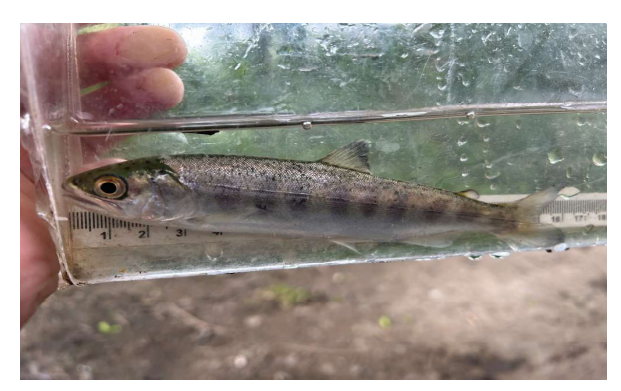
Figure 1: Coho Smolt from Peninsula Streams Smolt Trap

With the removal of the Smolt Trap from the Colquitz River, Peninsula Streams Society confirmed that a total of 4020 Coho Smolts were counted throughout the Spring Season. The Smolt Trap will be installed again in 2025.