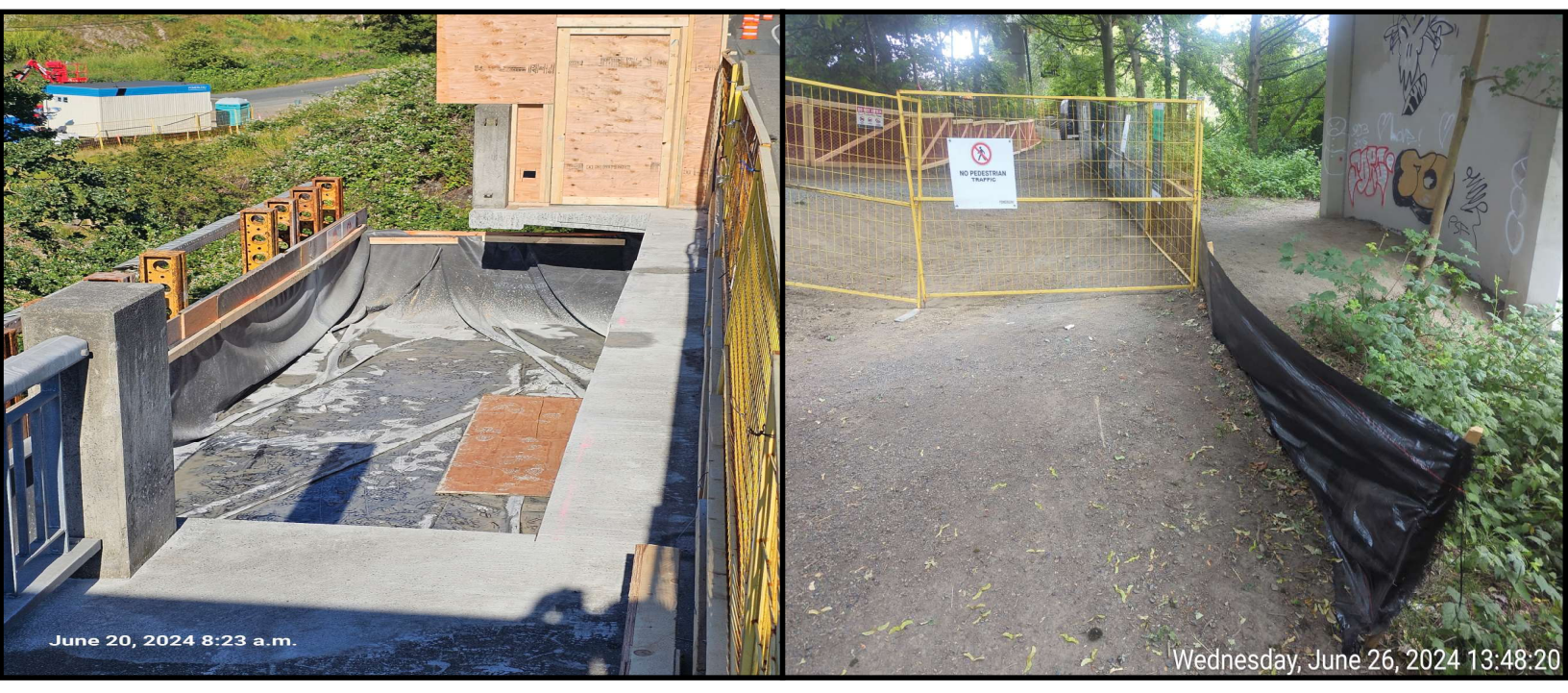
Figure 4: South Bridge Slurry Containment