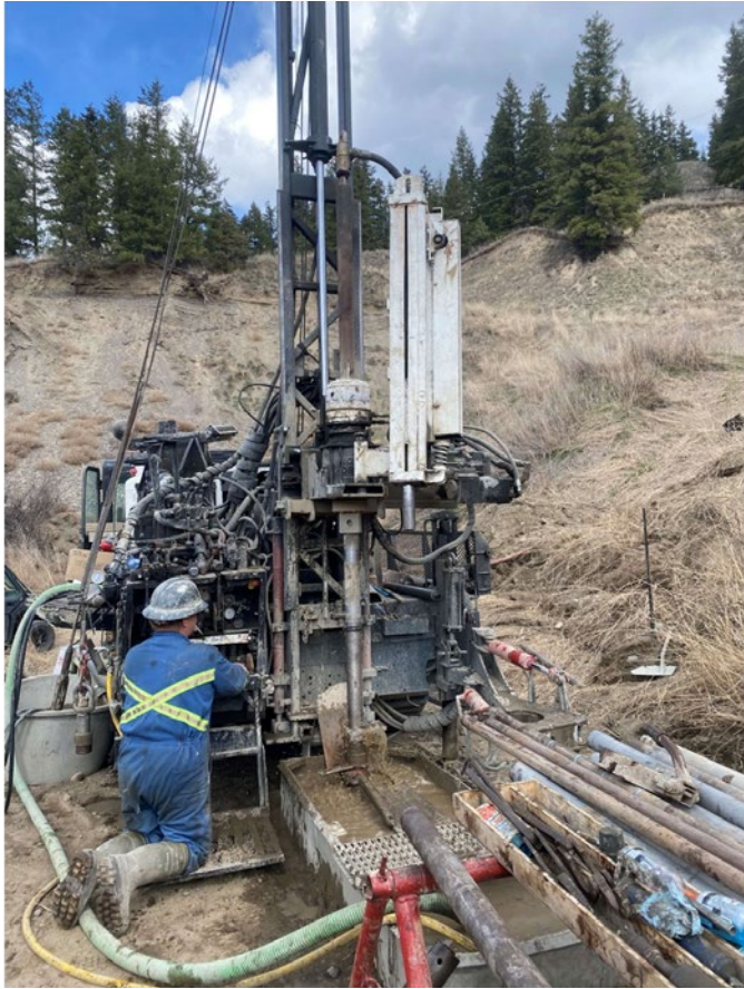
Crews used drill rigs in the Soda Creek-MacAlister Road Project area to collect soil and water samples, which informed options analysis.