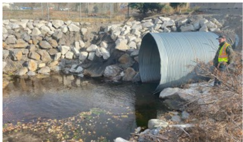
This temporary culvert was installed under the crossing and will be removed once the new bridge is in place.

Major works construction of the new bridge started in January 2024 and is anticipated to be complete later this summer.