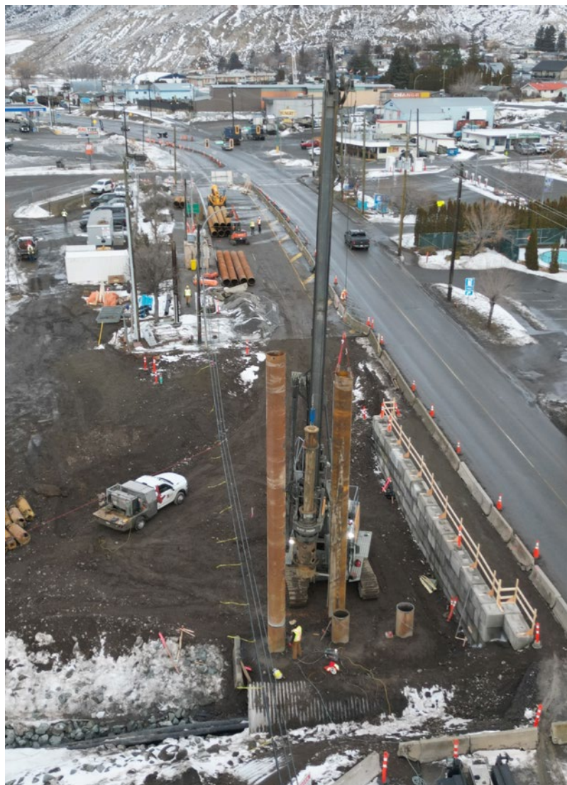
Bridge foundation is underway, including pile driving on the west side of the new crossing, as seen in this photo.