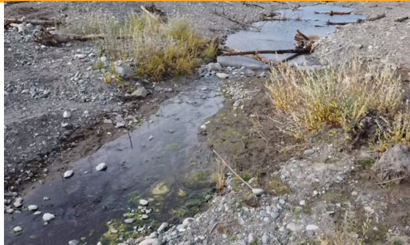
Environmental Restoration at Site 3, 22.1 KM west of Mamit Junction (October 2022)