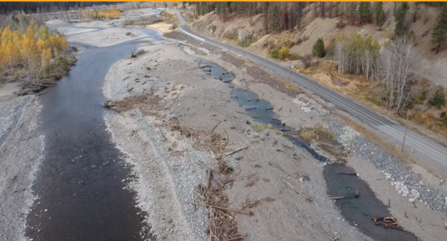
Side channel, including woody debris and roots, at Site 3 (October 2022)