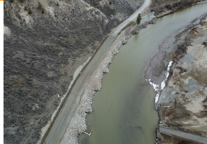
Clusters of rocks (groynes) are placed at Site 4 to deflect the continuous river flow, supporting movement of sediment which creates complexity in the river bed and fish habitat (March 2022)