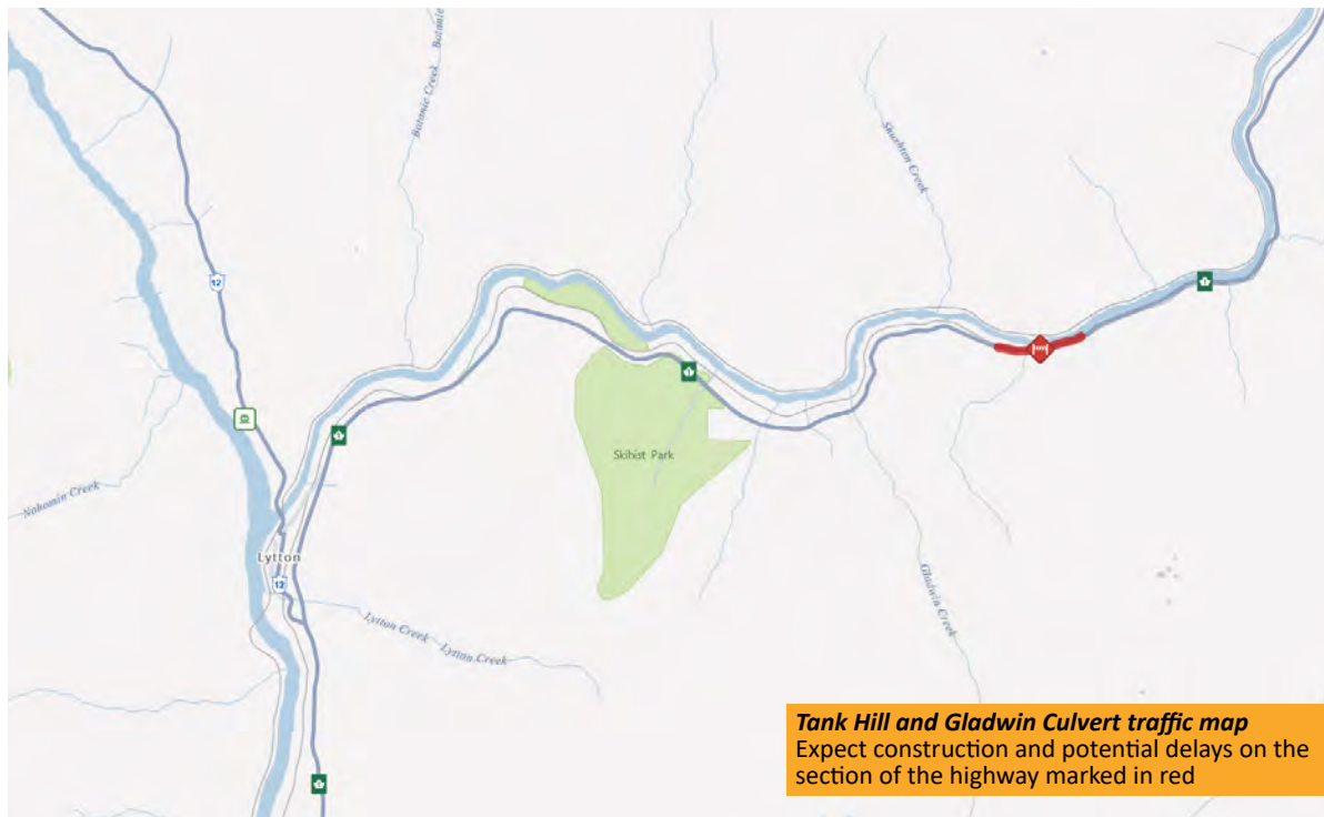
Tank Hill and Gladwin Culvert traffic map Expect construction and potential delays on the section of the highway marked in red

Always check DriveBC.ca before travelling for up-to-date information on road conditions and delays.