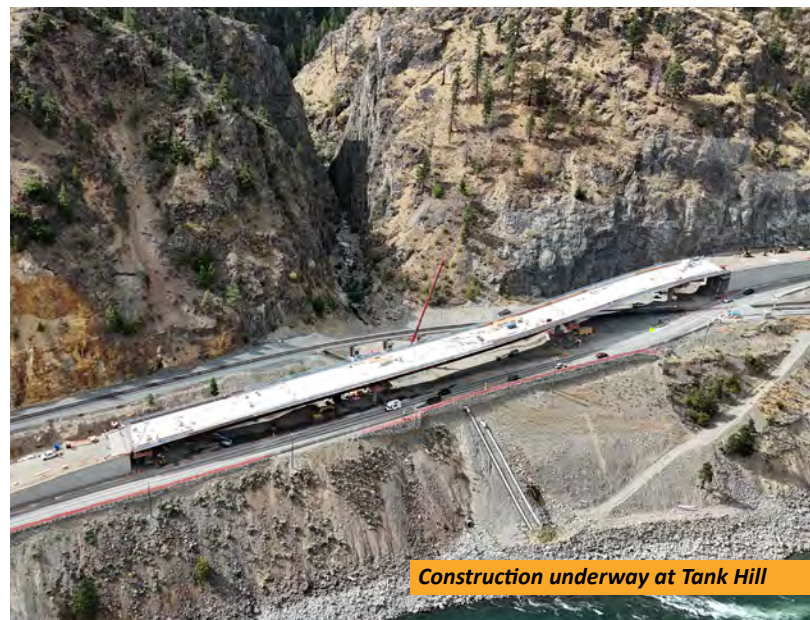
Construction underway at Tank Hill