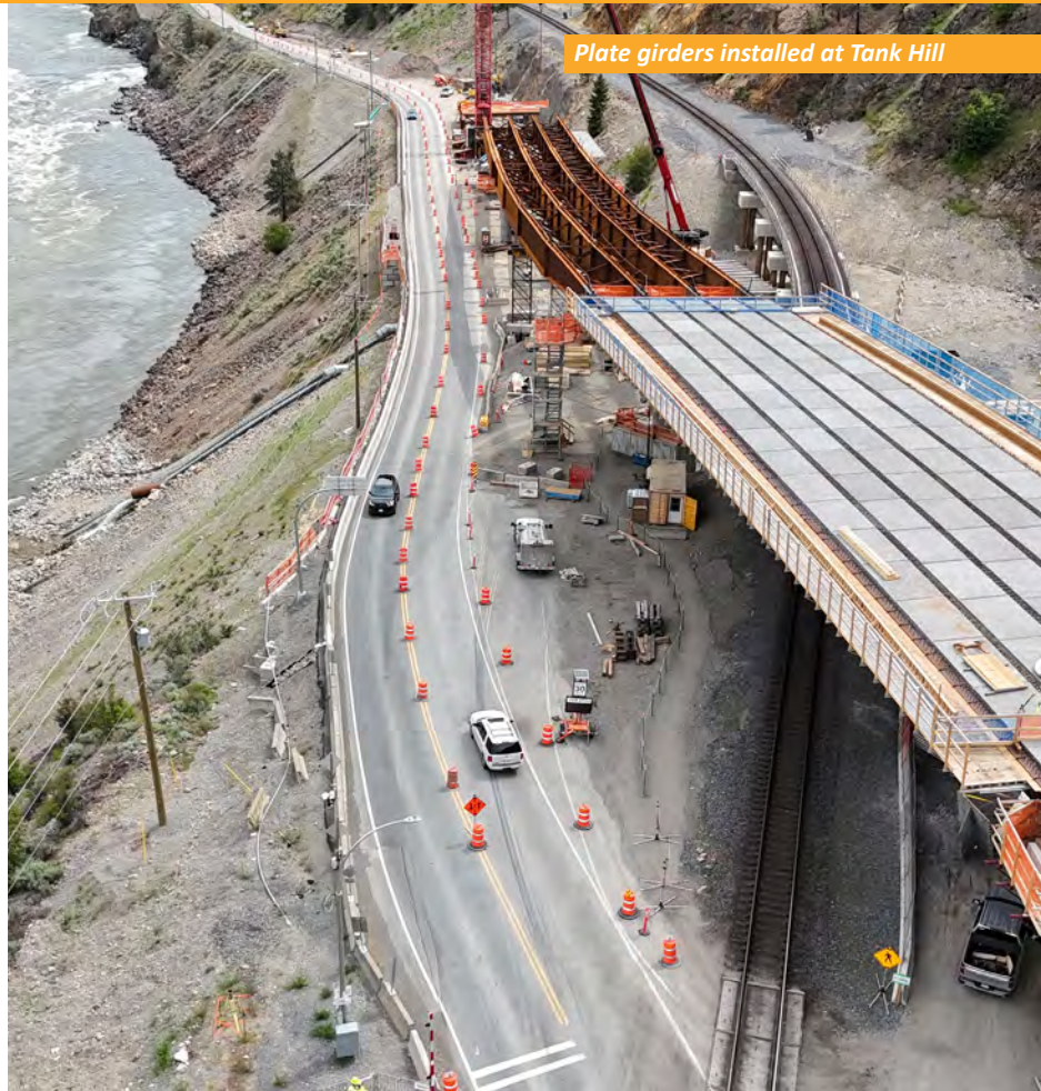
Plate girders installed at Tank Hill

Contact the project manager at: 250-645-9616