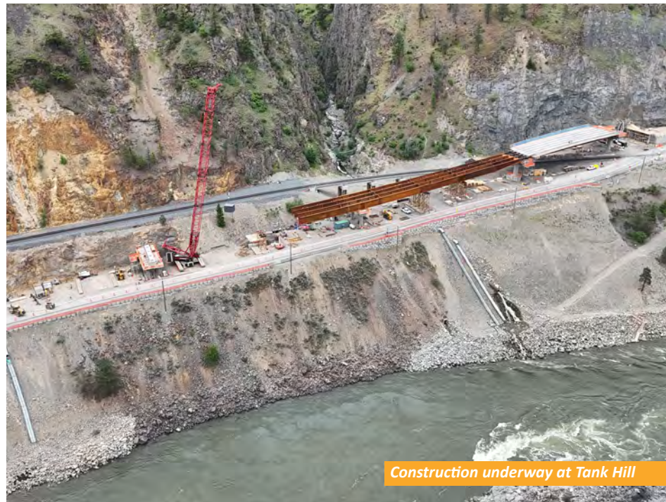
Construction underway at Tank Hill

Before travelling, check DriveBC.ca for up-to-date information on delays and road conditions.