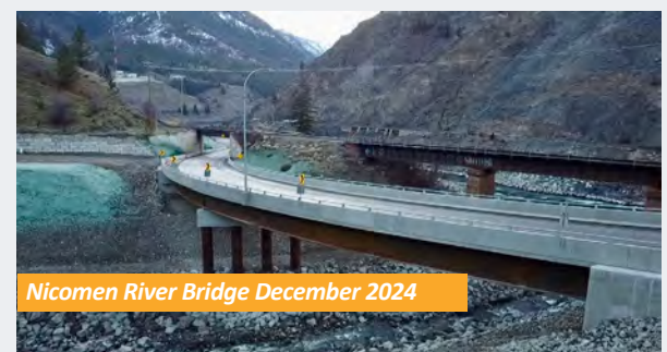
Nicomen River Bridge December 2024