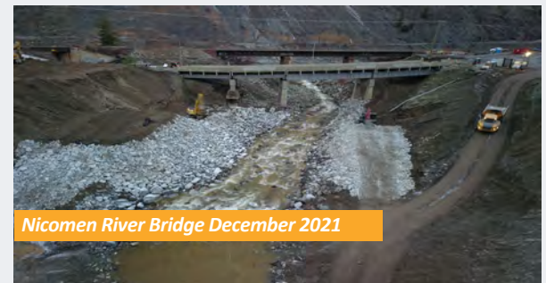
Nicomen River Bridge December 2021

Read the Nicomen River Bridge news release for more details.