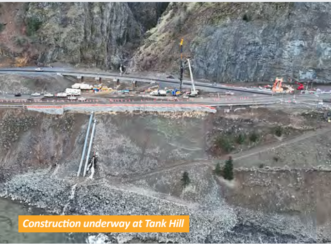
Construction underway at Tank Hill