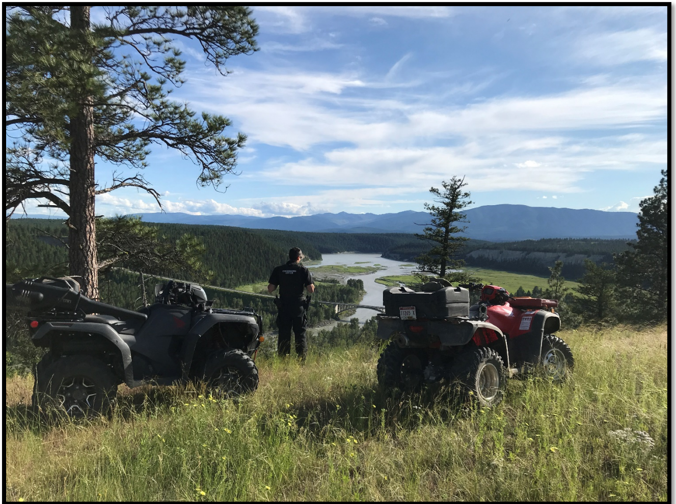
Sheep Mountain MVCA