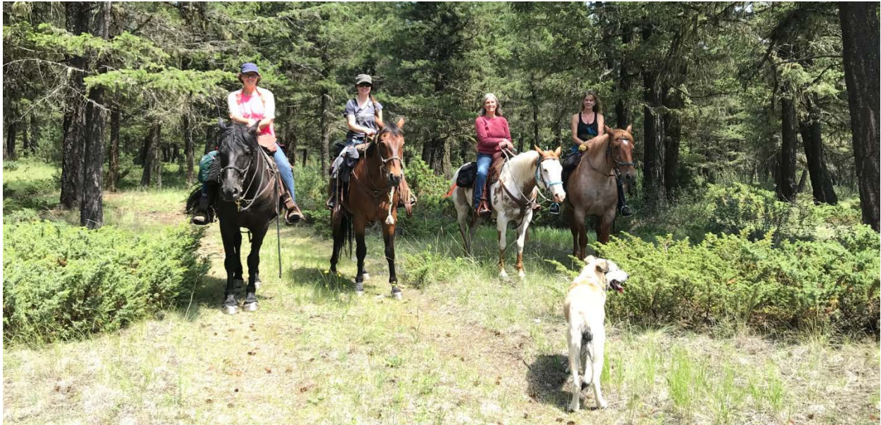
Wigwam Flats AMA – All types of user groups are encountered within AMA's