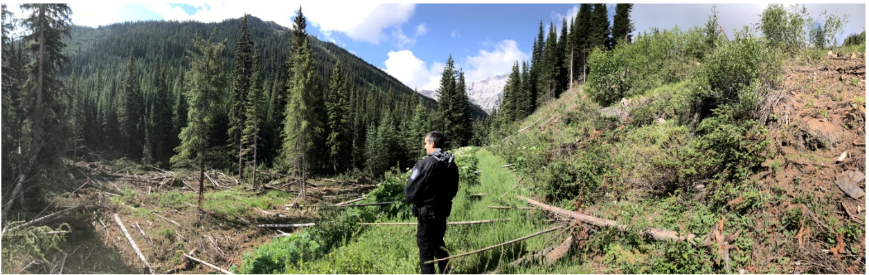
Weigert Creek AMA