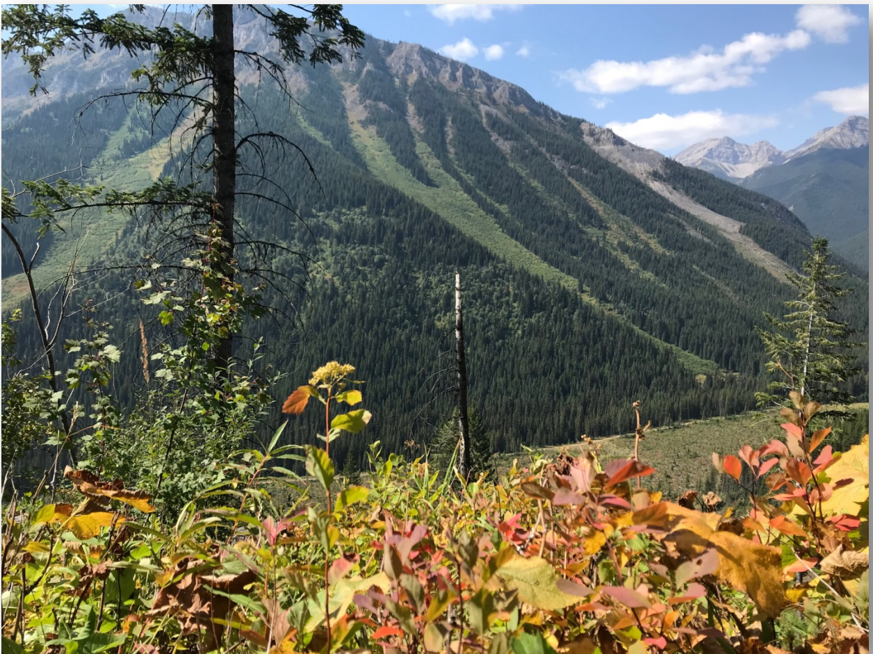
Weigert Creek Access Management Area