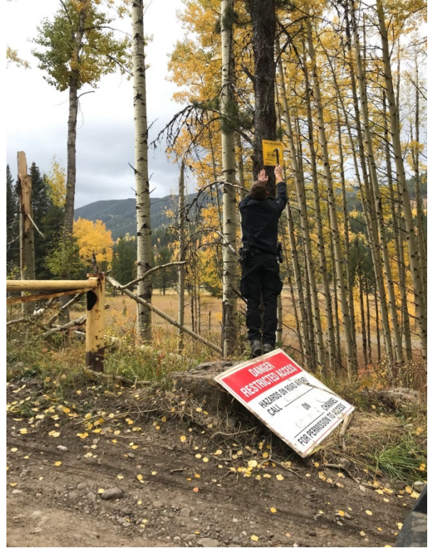
CO's post new AMA signage throughout the year in Electoral Area A AMA's.