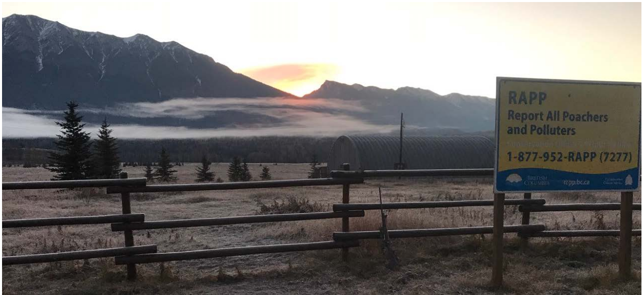
Grave Prairie AMA – Big Ranch