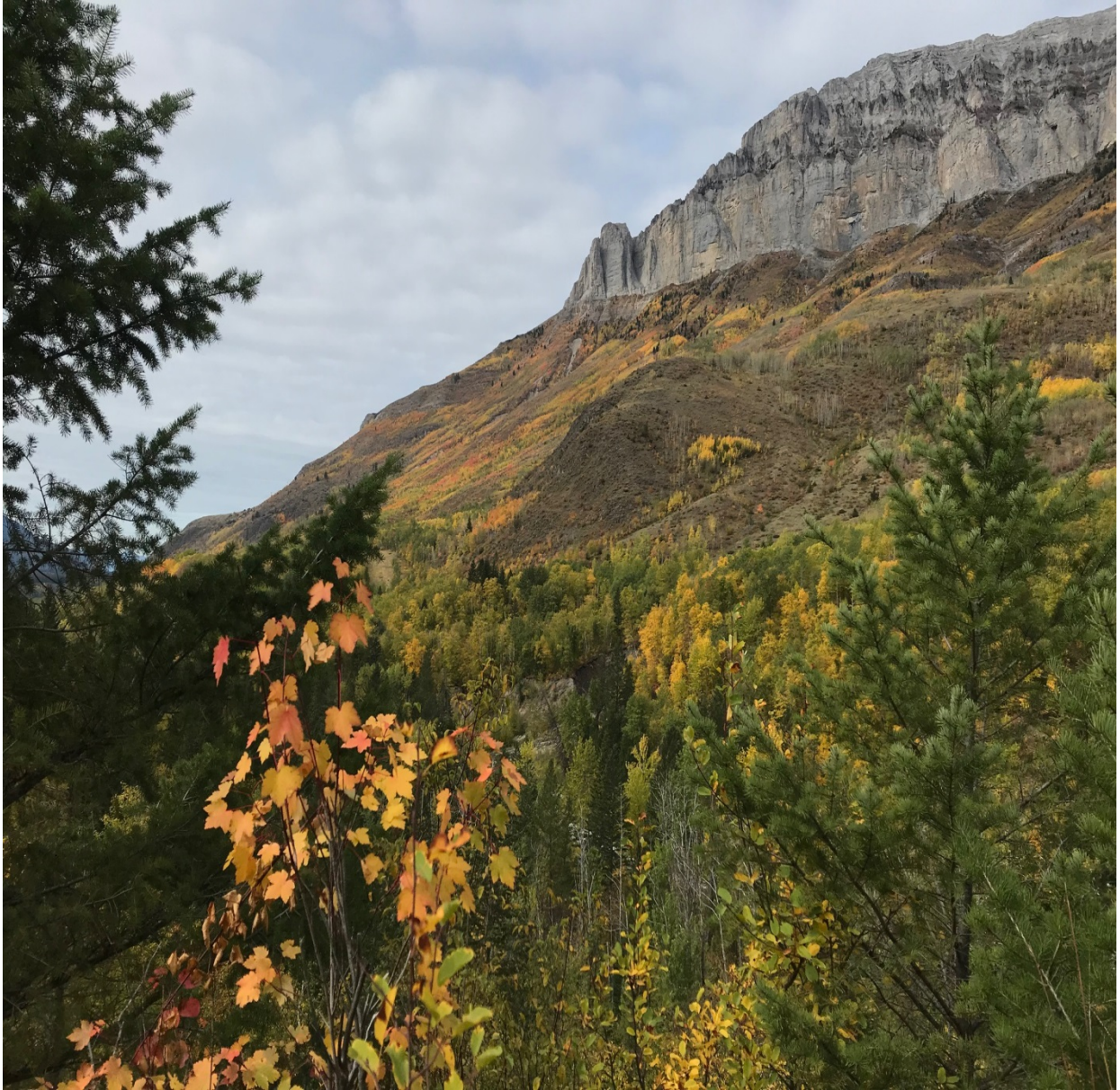
Wigwam Flats AMA – China Wall