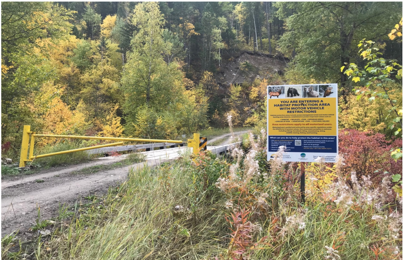
Windfall MVHC – FLNRO Habitat Biologists have been posting new educational signage