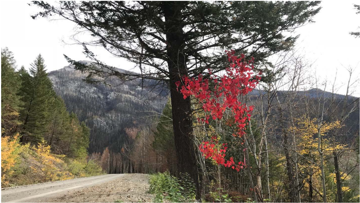
Soowa Mountain MVHCA