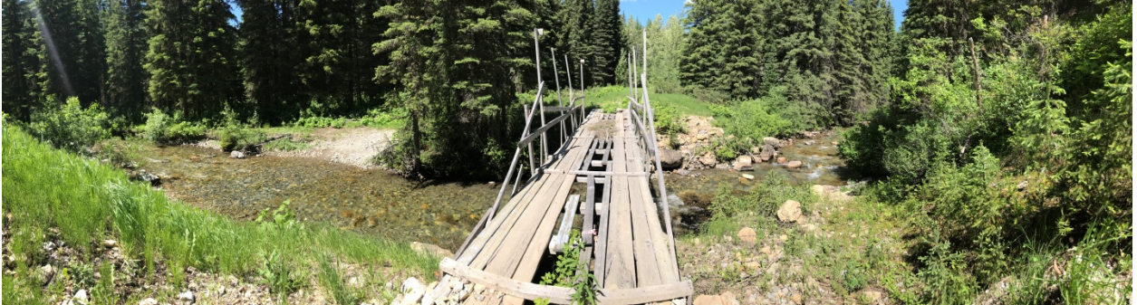
Commerce Creek in the East Flathead AMA