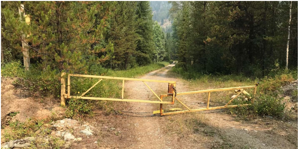
Upper Wigwam AMA – vandalized government gate