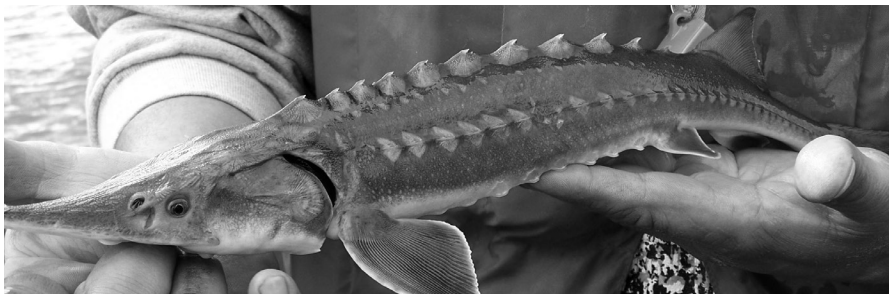
Conservation-cultured juvenile sturgeon recaptured at age two.

Help from the public will also be necessary for recovery and the Nechako White Sturgeon Recovery Initiative requests that you report date and location of all sightings or incidental captures, particularly in the Upper Nechako, Fraser Lake and Stuart/Takla Watersheds. If you observe or accidentally catch a sturgeon please call the Ministry of Forests, Lands, Natural Resource Operations and Rural Development at (250) 614-7400, or go to either of these web sites: www.nechakowhites-turgeon.org or www.env.gov.bc.ca/omineca/esd/faw/sturgeon