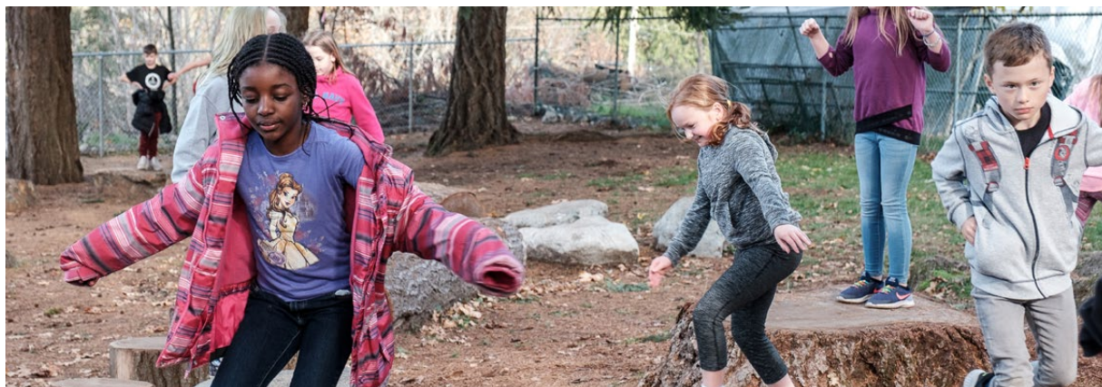
Savory School Parent Advisory Council, Langford.

All other sections of the Community Gaming Grants: Program Guidelines remain applicable to extra-provincial non-share corporations on an ongoing basis. Grant funds must remain under the management and control of the governing body specific to B.C.