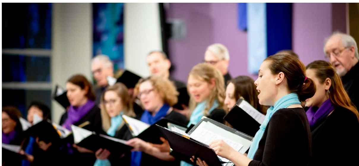
Les Echos du Pacifique , Coquitlam.

If an organization is unsure which sector their program(s) fall within, the application should be submitted in the sector that aligns most closely with the organization's purpose(s), as outlined in the constitution, or with the majority of the organization's eligible programming.