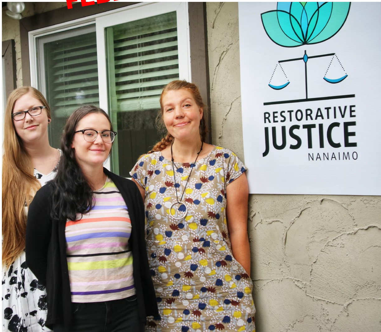
John Howard Society Nanaimo: Restorative Justice Program.

NOTE: THIS DOCUMENT APPLIES TO APPLICATIONS RECEIVED PRIOR TO FEBRUARY 1, 2025.