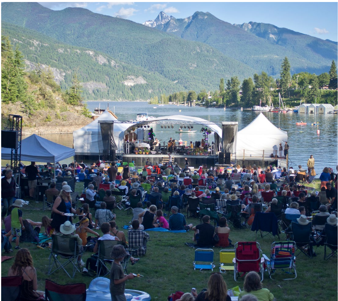
Kaslo Jazz Etc. Society, Kaslo.

NOTE: THIS DOCUMENT APPLIES TO APPLICATIONS RECEIVED PRIOR TO FEBRUARY 1, 2025.