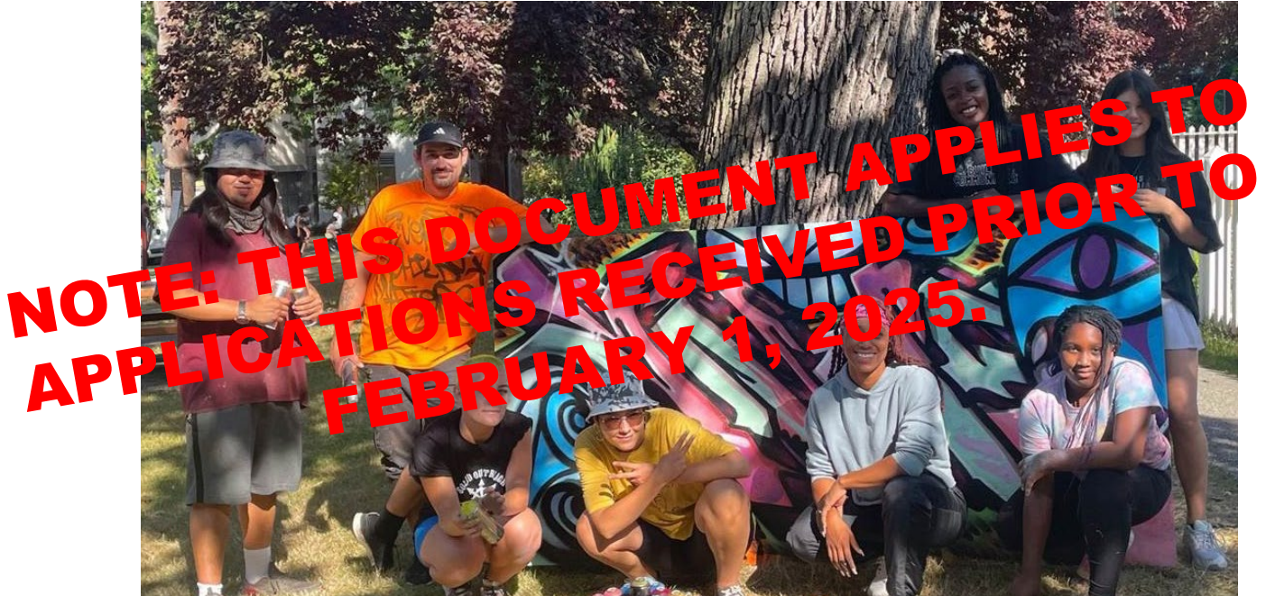
B.C. Black History Awareness Society, Victoria.