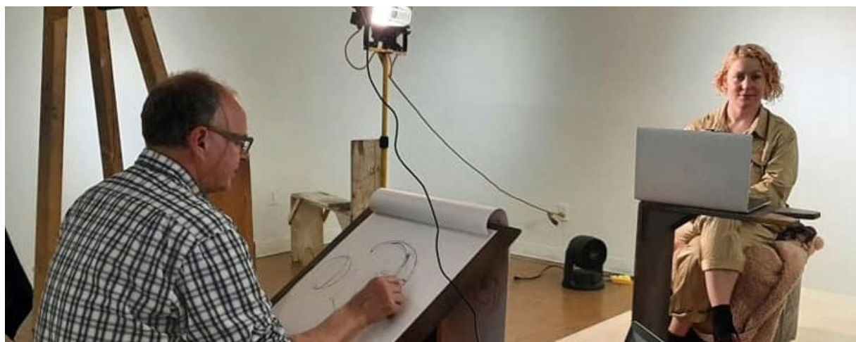
Xchanges Gallery & Studios Society, Victoria.