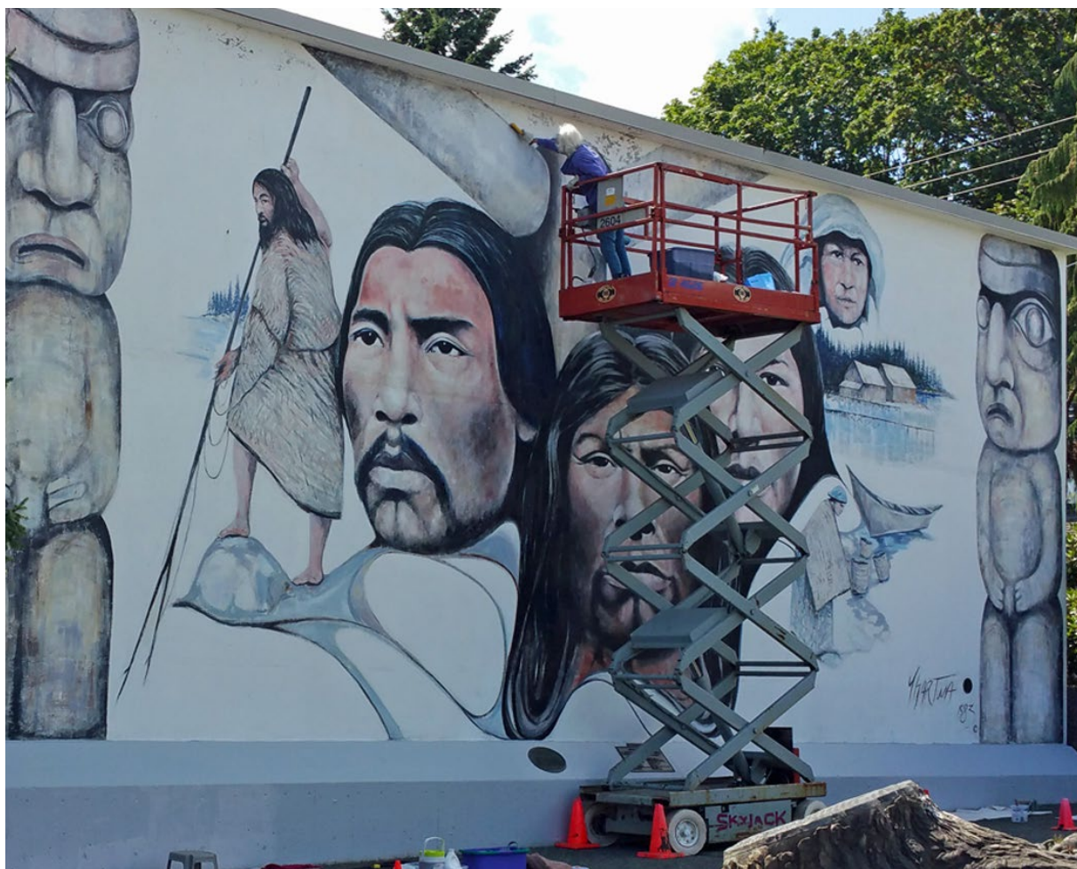
Chemainus Festival of Murals Society.

NOTE: THIS DOCUMENT APPLIES TO APPLICATIONS RECEIVED PRIOR TO FEBRUARY 1, 2025.