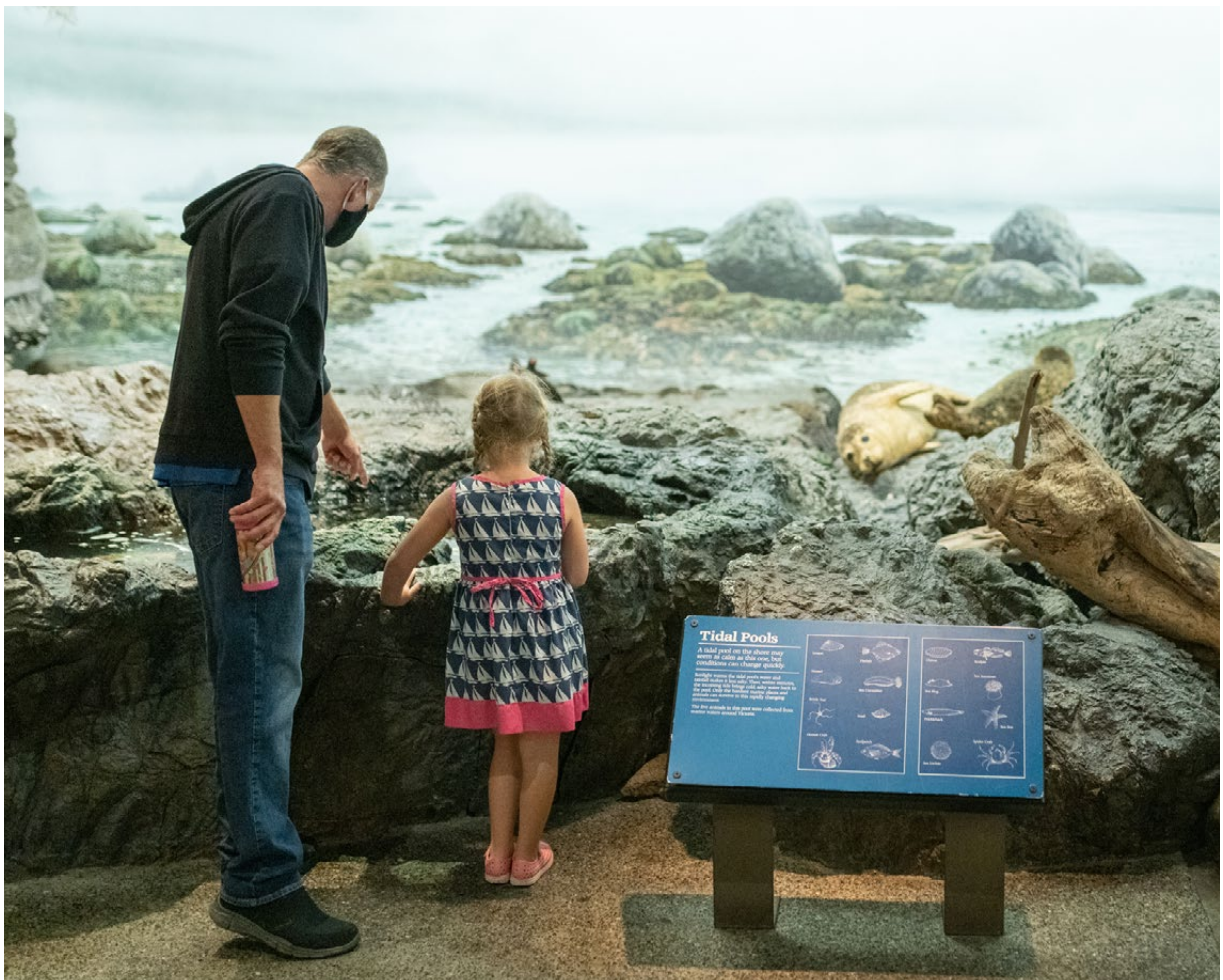
Royal BC Museum, Victoria.

NOTE: THIS DOCUMENT APPLIES TO APPLICATIONS RECEIVED PRIOR TO FEBRUARY 1, 2025.