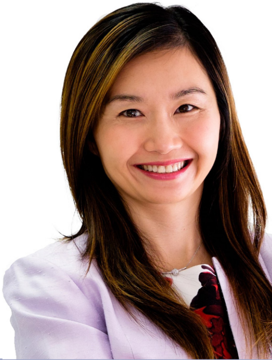
Honourable Anne Kang Minister of Municipal Affairs

B.C.'s public libraries are an important part of communities throughout the province, delivering services we rely on every day. They play a crucial role in promoting education and learning, while ensuring that people have access to important information and technology when they need it. As the Minister for public libraries, I am pleased to introduce our refreshed strategic plan for public library services.