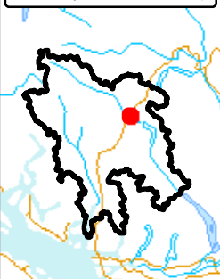
Sea to Sky NRD Overview Map