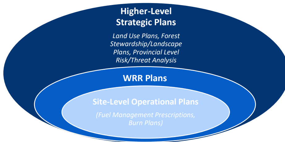
Figure 1. Plan type and scale in relation to WRR Plans.