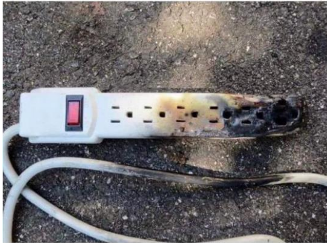
Anglemont Fire Department