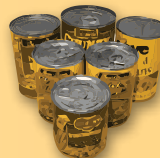
At least a three-day supply of non-perishable food. Manual can opener for cans