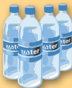
Water, four litres per person per day, for three days to one week, for drinking and sanitation