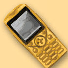
Cell phone with chargers, inverter or solar charger