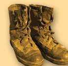
Seasonal clothing and footwear