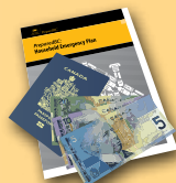
Copy of your emergency plan, copies of important documents and cash in small bills