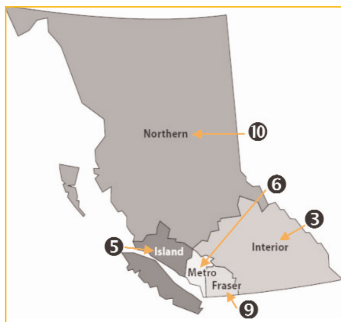
Figure B – B.C. map showing geographical breakdown of where the 33 investigations took place.

Two of the children who drowned had developmental disabilities that may have put them at increased risk. Both children drowned in natural bodies of water. One of these deaths was accidental; it was likely that a seizure was a contributory event. The other drowning was classified as suicide.