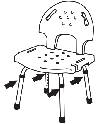
Figure 1: Adjustment areas on legs

! WARNING If adjustable, ensure that the spring buttons protrude fully through the adjustment holes of the leg frames.