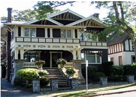
1568 Old Ocean Ave.