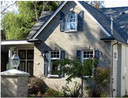
1560 Bittle St.