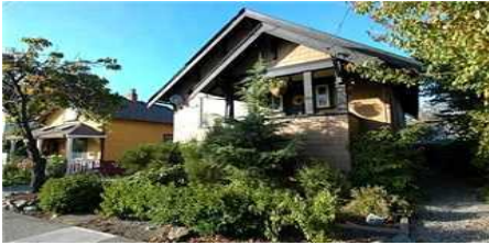
Subject Property – 1568 Bittle St.