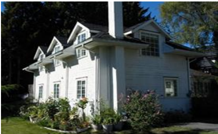
1532 Bittle St.