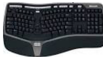
Microsoft Natural Ergonomic USB Keyboard 4000 B2M-00013

According to some studies, ergonomic keyboard designs, such as the Microsoft Natural line, have been associated with significant reduction of carpal tunnel syndrome symptoms. Rest your wrists against the plush palm rest in a relaxed, natural angle with this keyboard's curved key bed, ergonomic arc, and reversed slope. Apart from comfort and support, enjoy quick, customizable way to reach files, folders, and web pages with handy hot keys. For close-in tasks, use the Zoom Slider, located in the middle of the keyboard, to zoom in and out with the touch of a finger. Works with all workstations with a USB connector. Compatible with WIN 7/8. 1 Year Warranty.