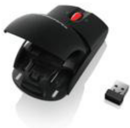
Lenovo Laser Wireless Mouse 2.4 GHZ WIRELESS TECHNOLOGY 0A36188