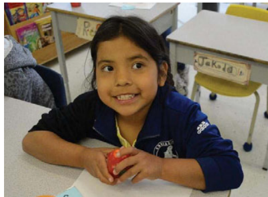
Student participating in the BC School Fruit and Vegetable Nutritional Program